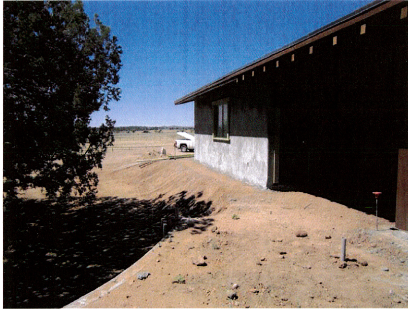
Figure 3 – Rear of Building looking Northwesterly