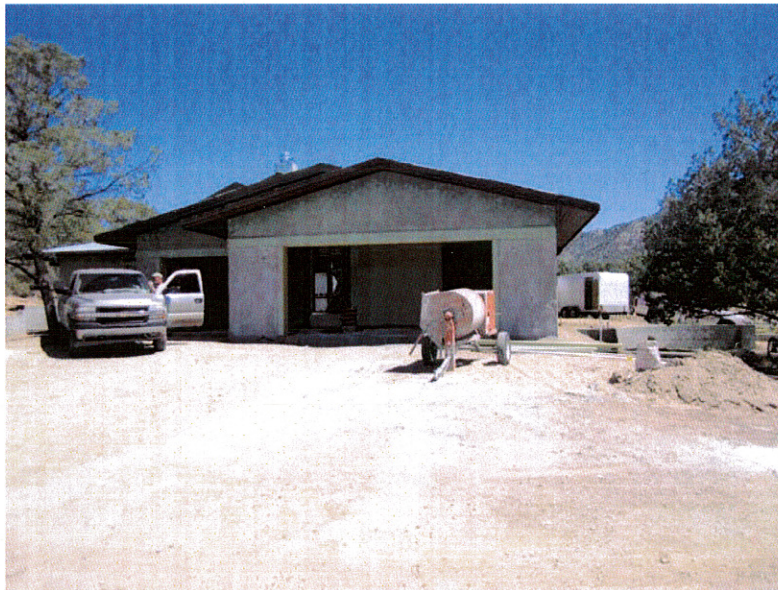
Figure 2 - Garage looking southeasterly