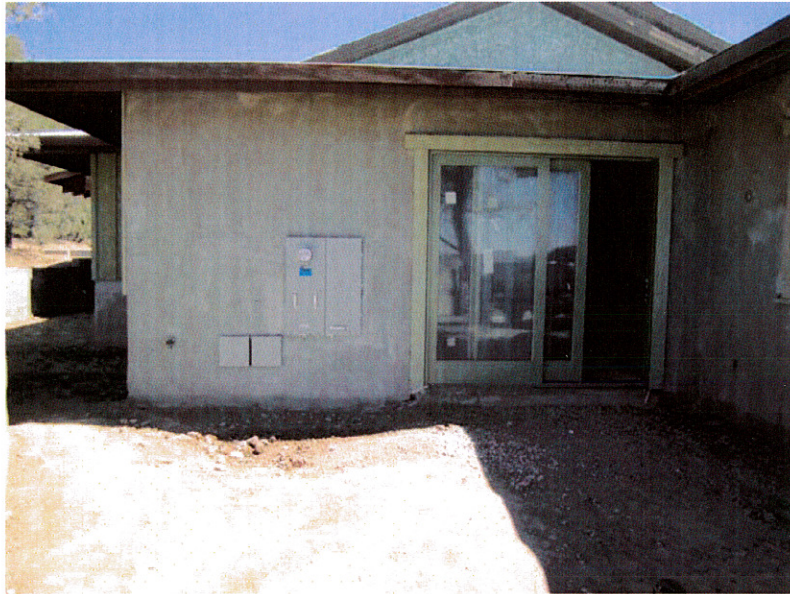
Figure 1 - Entry Door looking southeasterly

If using the Elevation Certificate to obtain NFIP flood insurance, affix at least two building photographs below according to the instructions for Item A6. Identify all photographs with: date taken; "Front View" and "Rear View"; and, if required, "Right Side View" and "Left Side View." If submitting more photographs than will fit on this page, use the Continuation Page, following.