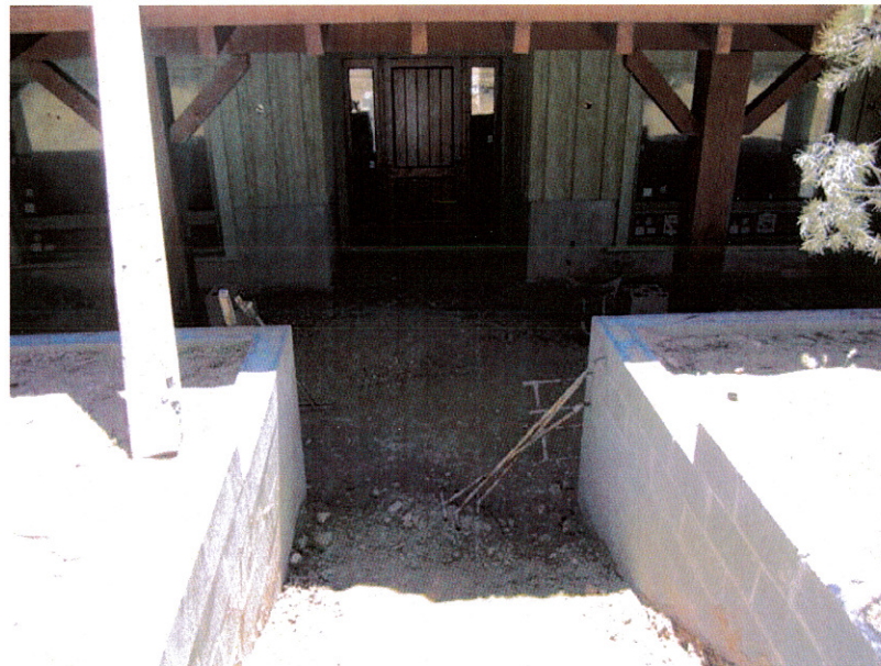
Figure 4 – Top of Cut Wall looking Southwesterly