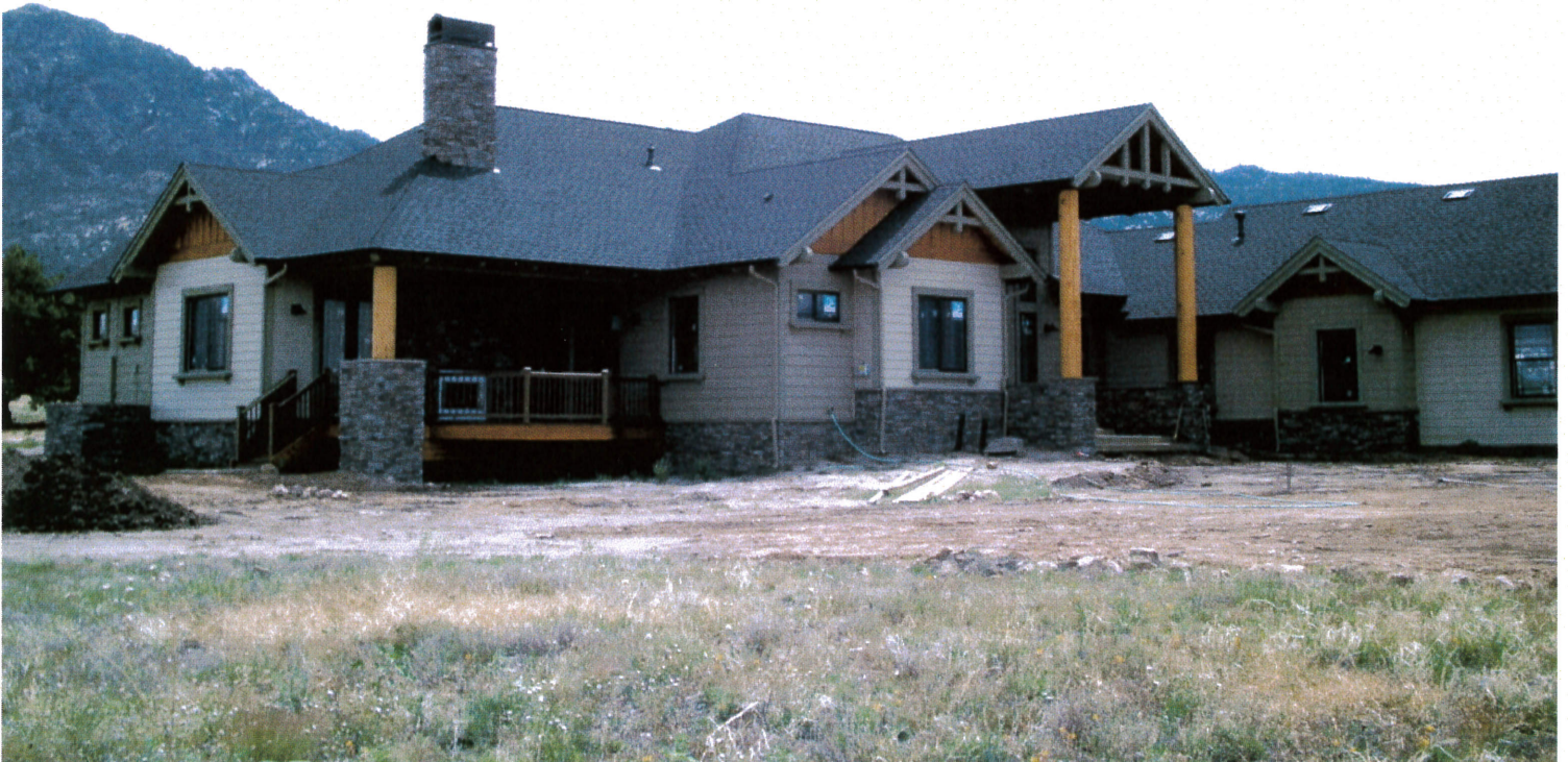
Front Left View Taken 6-4-09:

If using the Elevation Certificate to obtain NFIP flood insurance, affix at least two building photographs below according to the instructions for Item A6. Identify all photographs with: date taken; "Front View" and "Rear View"; and, if required, "Right Side View" and "Left Side View." If submitting more photographs than will fit on this page, use the Continuation Page on the reverse.