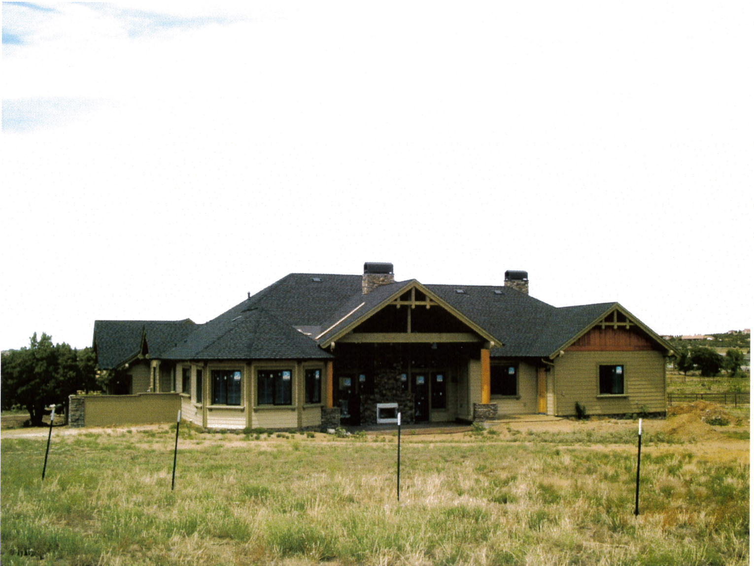
Rear Right View Taken 6-4-09:

If submitting more photographs than will fit on the preceding page, affix the additional photographs below. Identify all photographs with: date taken; "Front View" and "Rear View"; and, if required, "Right Side View" and "Left Side View."