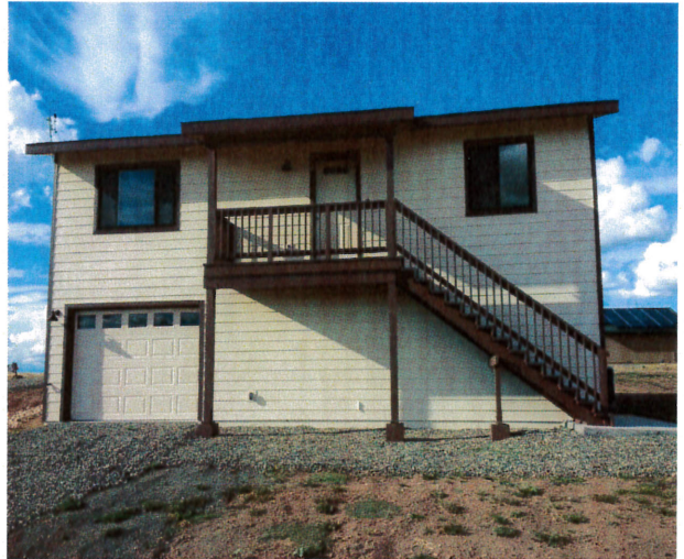
REAR VIEW / SOUTH SIDE (9-6-2015)