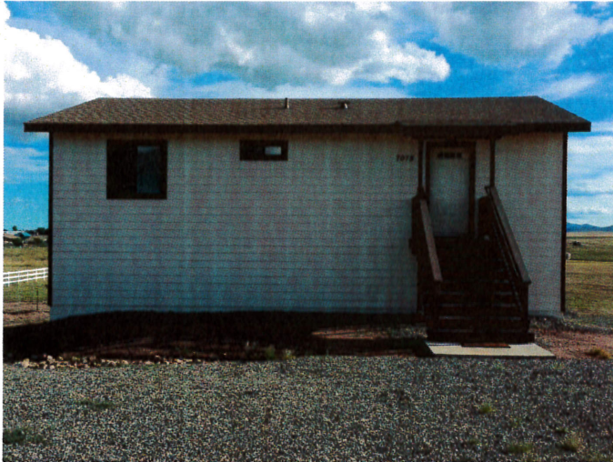
FRONT VIEW / NORTH SIDE (9-6-2015)