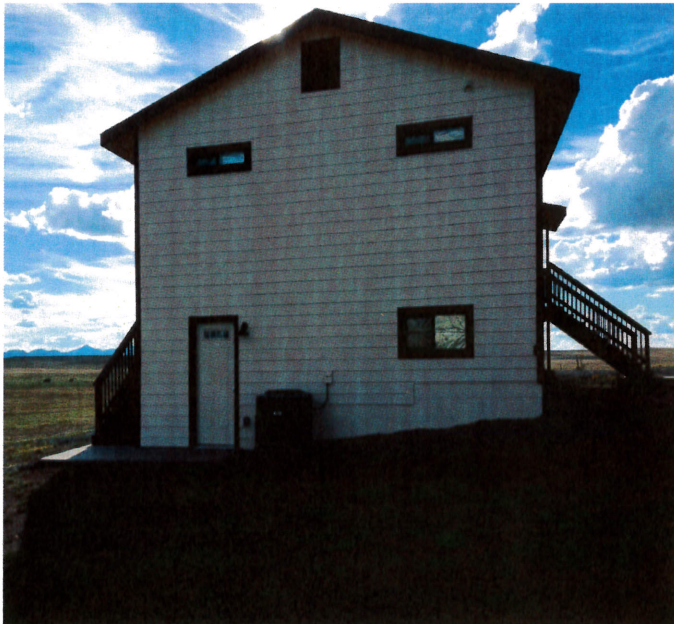
LEFT SIDE VIEW / EAST SIDE (9-6-2015)