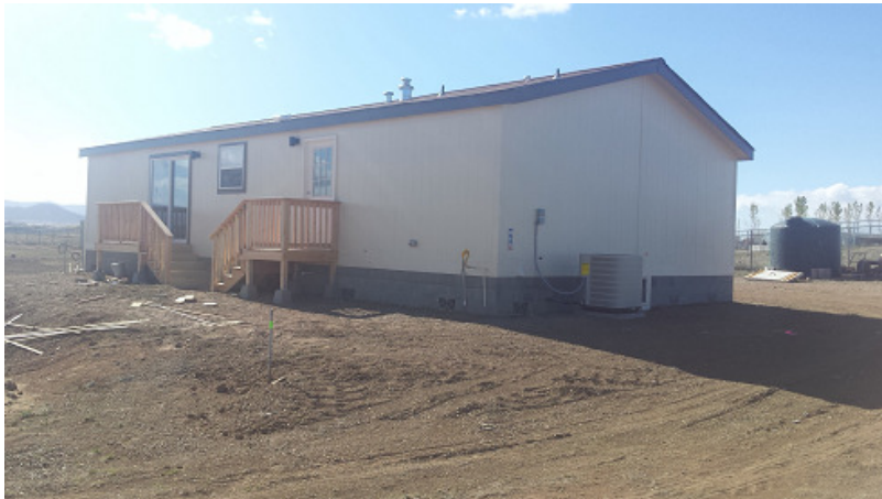
Rear Left View, Date Taken: 4/26/2016