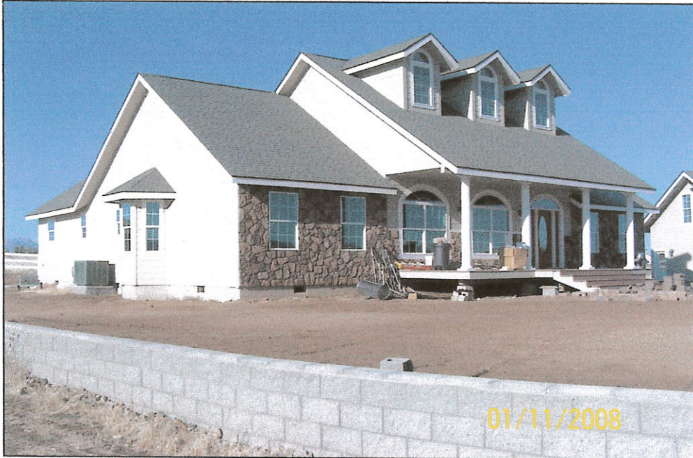
FRONT VIEW (FROM FRONT LEFT CORNER)

If using the Elevation Certificate to obtain NFIP flood insurance, affix at least two building photographs below according to the instructions for Item A6. Identify all photographs with: date taken; "Front View" and "Rear View"; and, if required, "Right Side View" and "Left Side View." If submitting more photographs than will fit on this page, use the Continuation Page, following.