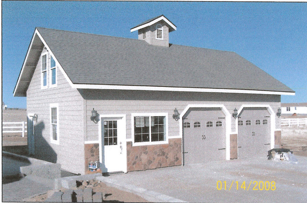
FRONT VIEW (FROM FRONT LEFT CORNER)

If using the Elevation Certificate to obtain NFIP flood insurance, affix at least two building photographs below according to the instructions for Item A6. Identify all photographs with: date taken; "Front View" and "Rear View"; and, if required, "Right Side View" and "Left Side View." If submitting more photographs than will fit on this page, use the Continuation Page, following.