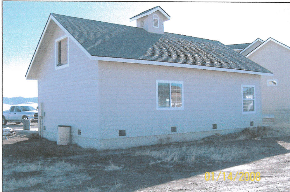
REAR VIEW (FROM RIGHT REAR CORNER)