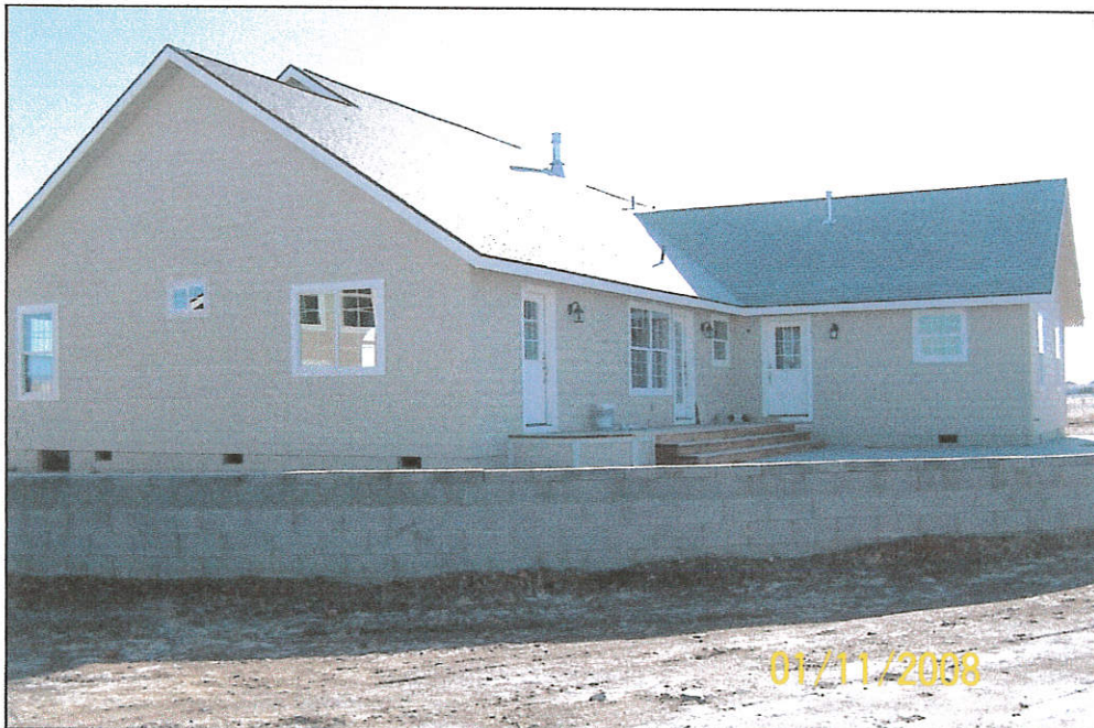
REAR VIEW (FROM RIGHT REAR CORNER)