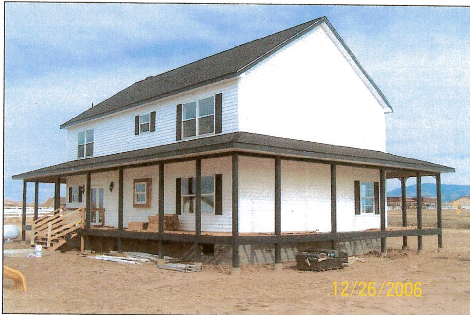
REAR VIEW (FROM RIGHT REAR CORNER)