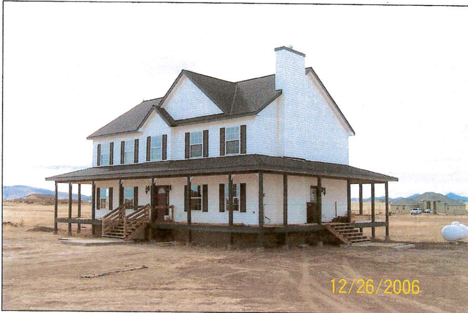
FRONT VIEW (FROM RIGHT FRONT CORNER)

If using the Elevation Certificate to obtain NFIP flood insurance, affix at least two building photographs below according to the instructions for Item A6. Identify all photographs with: date taken; "Front View" and "Rear View"; and, if required, "Right Side View" and "Left Side View." If submitting more photographs than will fit on this page, use the Continuation Page, following.