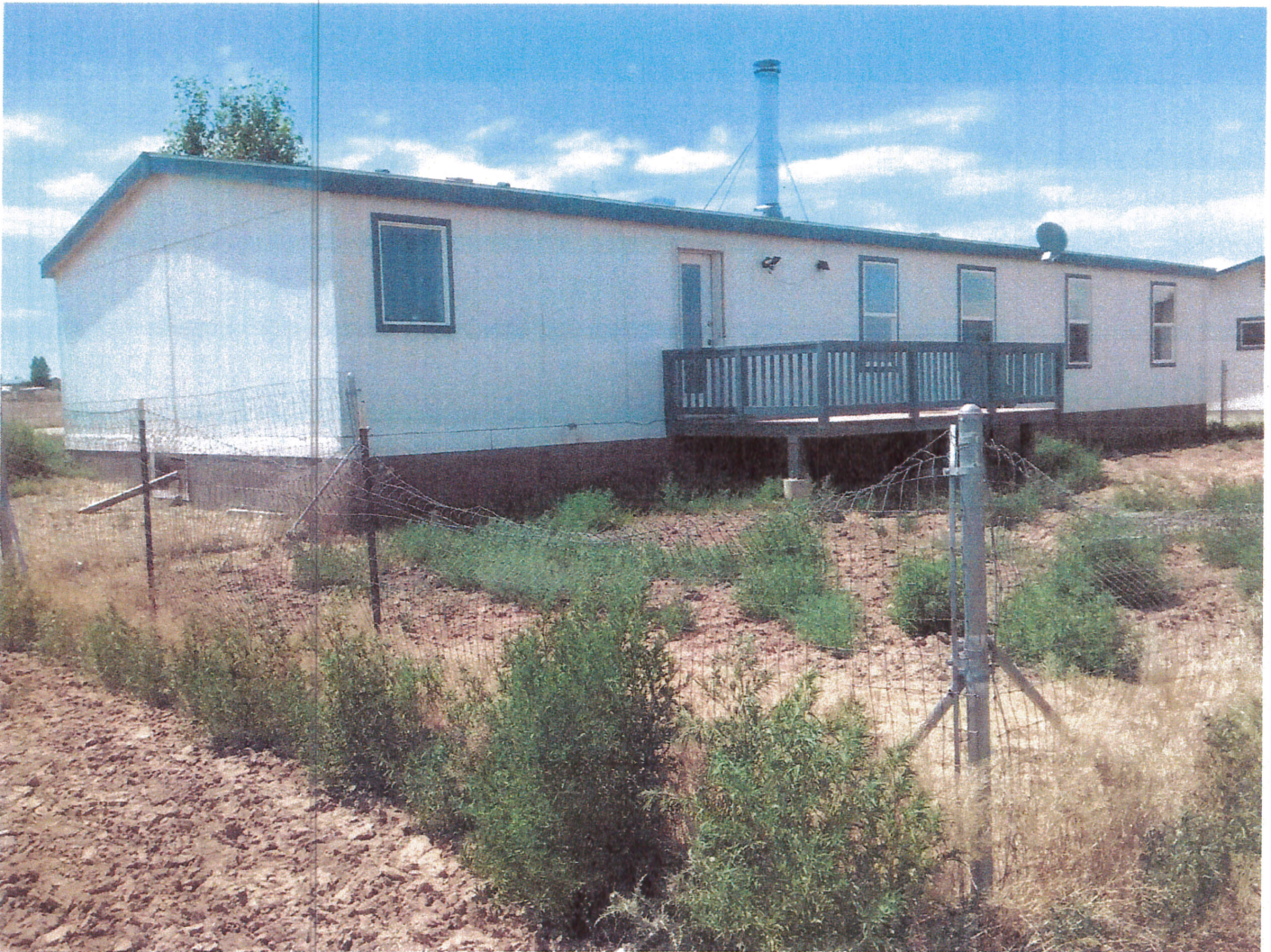
SOUTH END & EAST SIDE OF STRUCTURE

If submitting more photographs than will fit on the preceding page, affix the additional photographs below. Identify all photographs with: date taken; "Front View" and "Rear View"; and, if required, "Right Side View" and "Left Side View." When applicable, photographs must show the foundation with representative examples of the flood openings or vents, as indicated in Section A8.