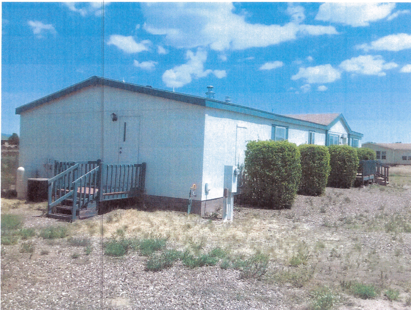
NORTH END & WEST SIDE OF STRUCTURE – C2E AC PAD TO LEFT OF STAIRS

If using the Elevation Certificate to obtain NFIP flood insurance, affix at least 2 building photographs below according to the instructions for Item A6. Identify all photographs with date taken; "Front View" and "Rear View"; and, if required, "Right Side View" and "Left Side View." When applicable, photographs must show the foundation with representative examples of the flood openings or vents, as indicated in Section A8. If submitting more photographs than will fit on this page, use the Continuation Page.