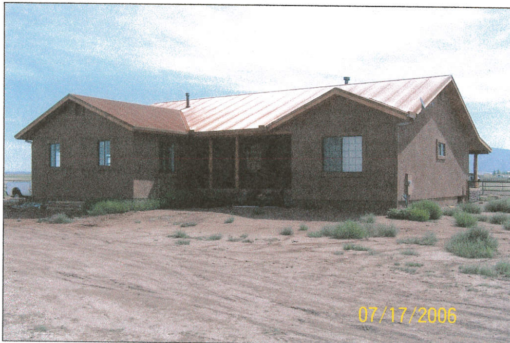
FRONT VIEW (FROM RIGHT FRONT CORNER)