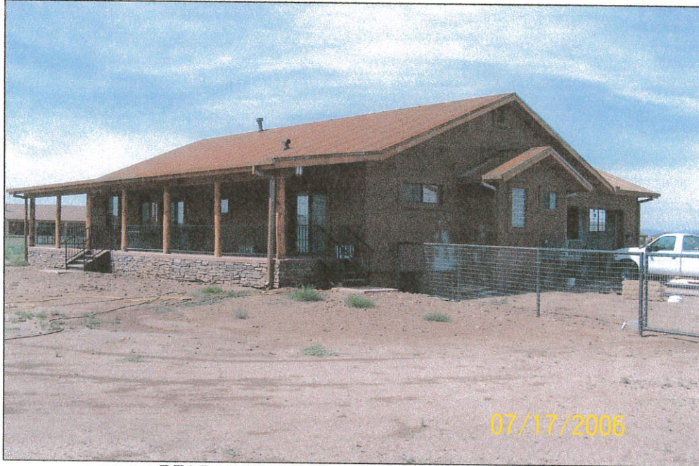
REAR VIEW (FROM RIGHT REAR CORNER)

If using the Elevation Certificate to obtain NFIP flood insurance, affix at least two building photographs below according to the instructions for Item A6. Identify all photographs with: date taken; "Front View" and "Rear View"; and, if required, "Right Side View" and "Left Side View." If submitting more photographs than will fit on this page, use the Continuation Page, following.