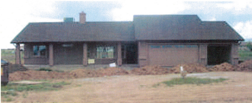
FRONT OF HOUSE LOOKING SOUTH FROM ROAD 8-24-06