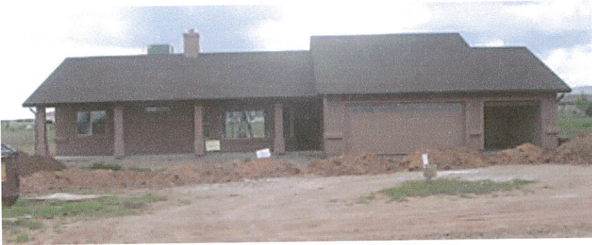
FRONT OF HOUSE LOOKING SOUTH FROM ROAD 8-24-06

If using the Elevation Certificate to obtain NFIP flood insurance, affix at least two building photographs below according to the instructions for Item A6. Identify all photographs with: date taken; "Front View" and "Rear View"; and, if required, "Right Side View" and "Left Side View." If submitting more photographs than will fit on this page, use the Continuation Page, following.