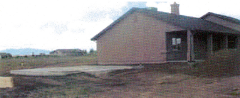
EAST SIDE OF HOUSE AND DETACHED GARAGE SLAB 8-24-06