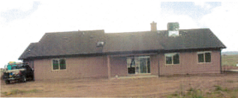
BACK OF HOUSE LOOKING NORTH 8-24-06