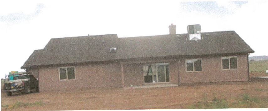
BACK OF HOUSE LOOKING NORTH 8-24-06