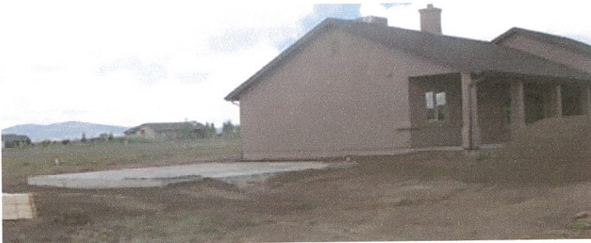
EAST SIDE OF HOUSE AND DETACHED GARAGE SLAB 8-24-06