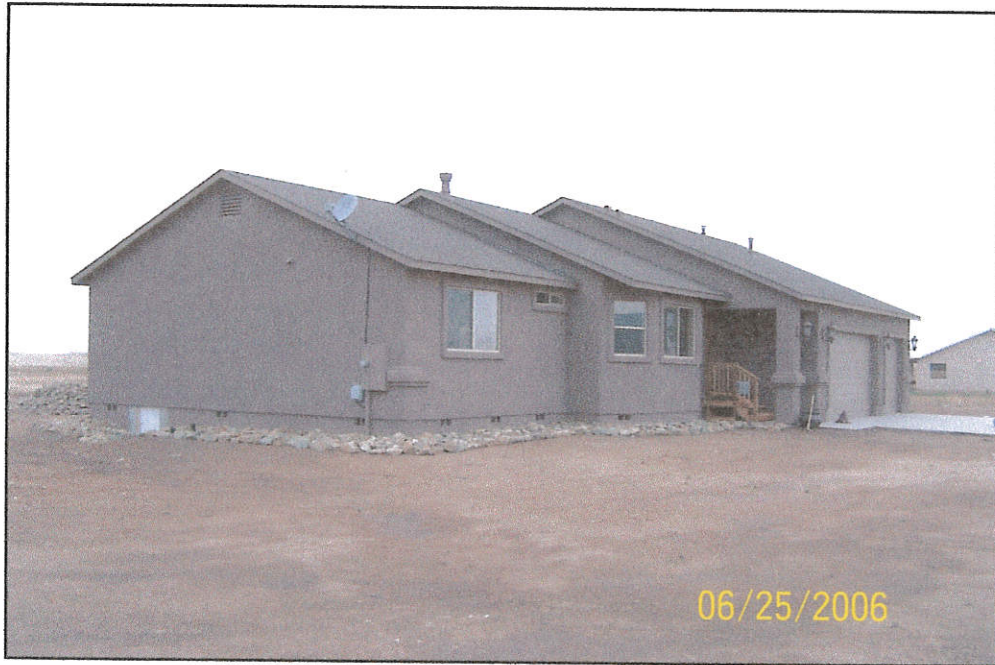
FRONT VIEW (FROM LEFT FRONT CORNER)

If using the Elevation Certificate to obtain NFIP flood insurance, affix at least two building photographs below according to the instructions for Item A6. Identify all photographs with: date taken; "Front View" and "Rear View"; and, if required, "Right Side View" and "Left Side View." If submitting more photographs than will fit on this page, use the Continuation Page, following.