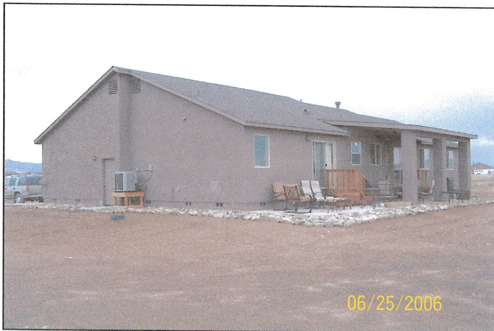
REAR VIEW (FROM LEFT REAR CORNER)