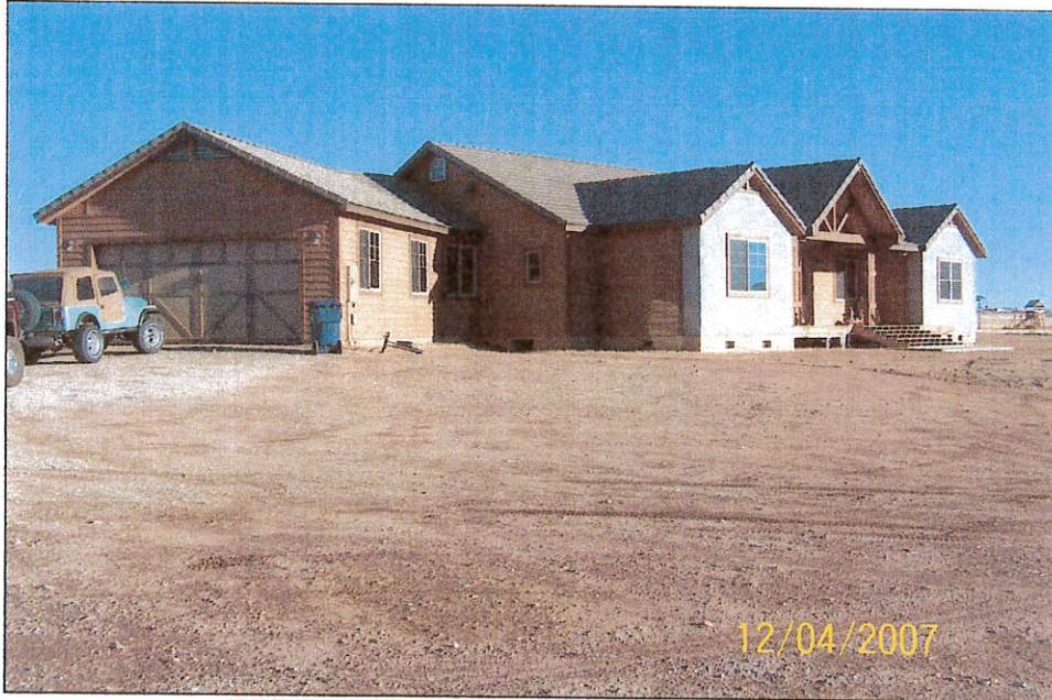
FRONT VIEW (FROM FRONT LEFT CORNER)

If using the Elevation Certificate to obtain NFIP flood insurance, affix at least two building photographs below according to the instructions for Item A6. Identify all photographs with: date taken; "Front View" and "Rear View"; and, if required, "Right Side View" and "Left Side View." If submitting more photographs than will fit on this page, use the Continuation Page, following.