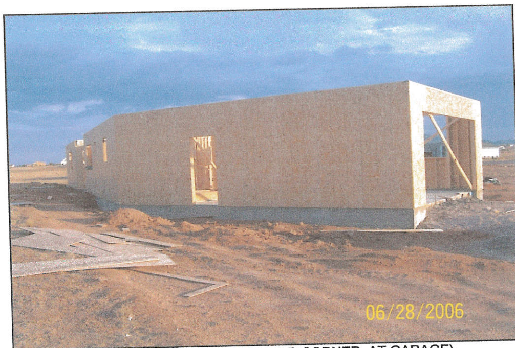
REAR VIEW (FROM RIGHT REAR CORNER, AT GARAGE)