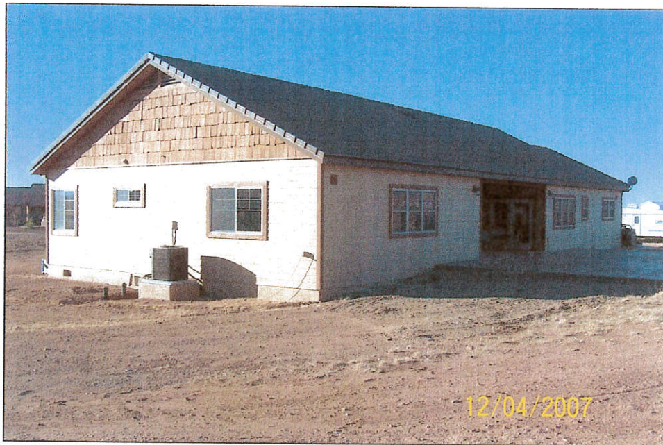
REAR VIEW (FROM RIGHT REAR CORNER)