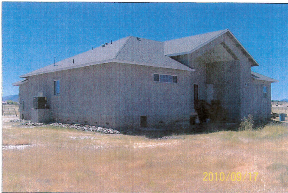
REAR VIEW (from right rear corner)