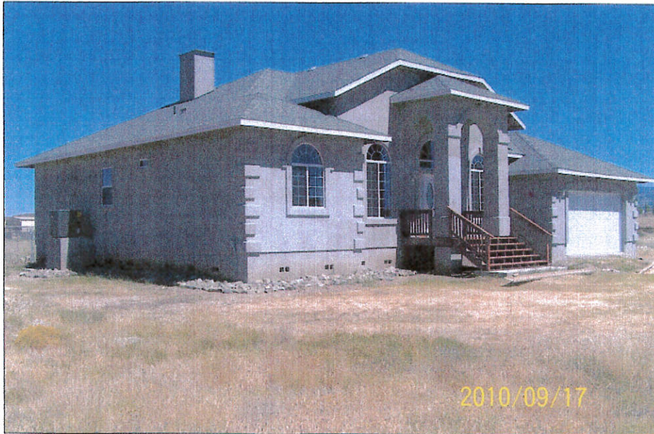
FRONT VIEW (from front left corner)

If using the Elevation Certificate to obtain NFIP flood insurance, affix at least two building photographs below according to the instructions for Item A6. Identify all photographs with: date taken; "Front View" and "Rear View"; and, if required, "Right Side View" and "Left Side View." If submitting more photographs than will fit on this page, use the Continuation Page on the reverse.