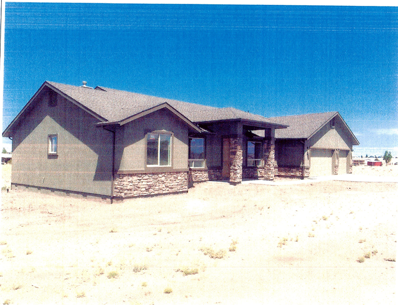
SOUTH END/EAST SIDE OF STRUCTURE

If using the Elevation Certificate to obtain NFIP flood insurance, affix at least 2 building photographs below according to the instructions for Item A6. Identify all photographs with date taken; "Front View" and "Rear View"; and, if required, "Right Side View" and "Left Side View." When applicable, photographs must show the foundation with representative examples of the flood openings or vents, as indicated in Section A8. If submitting more photographs than will fit on this page, use the Continuation Page.