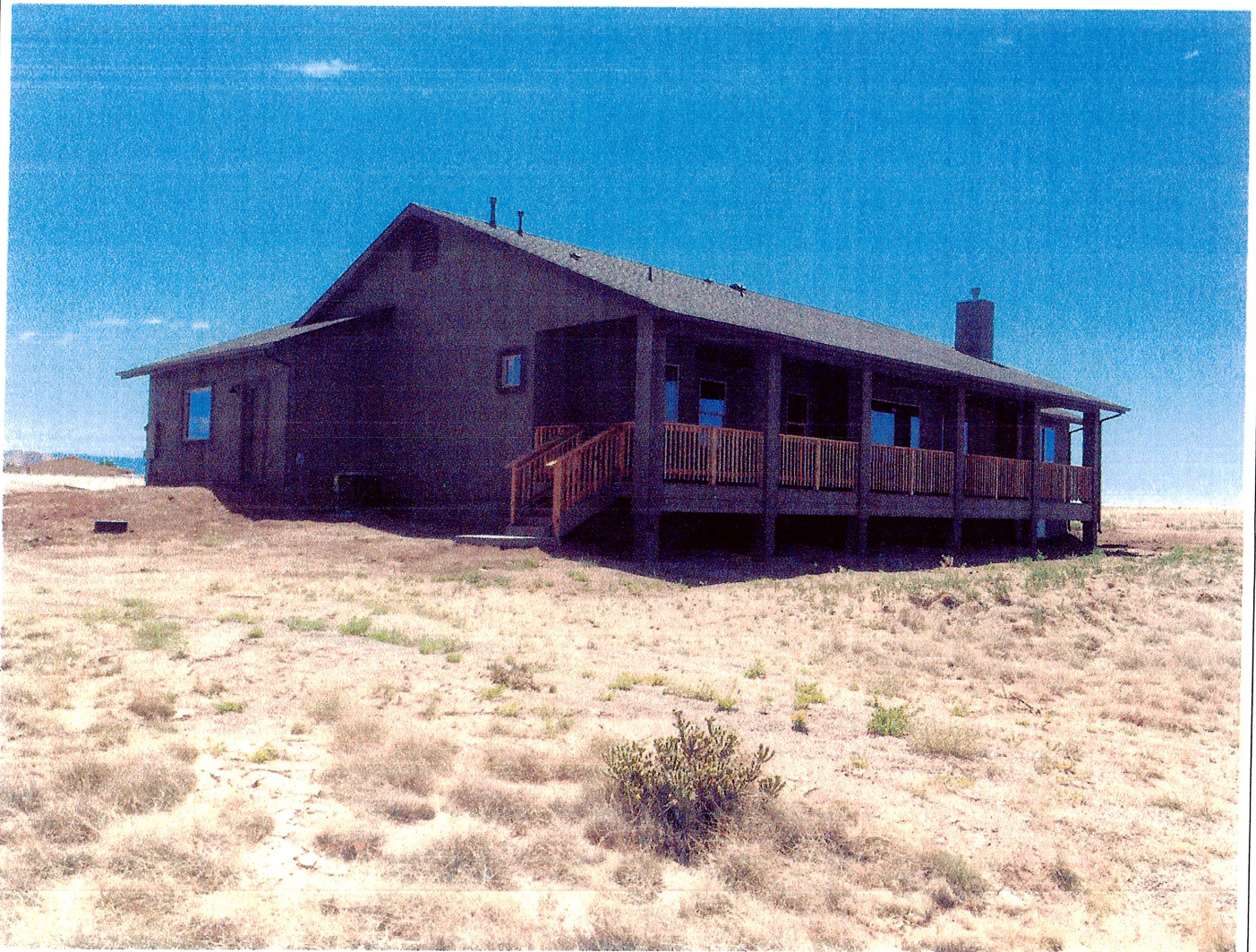
NORTH END/WEST SIDE OF STRUCTURE. AC PAD ON N. END AT SHED-ROOFED POP OUT.

If submitting more photographs than will fit on the preceding page, affix the additional photographs below. Identify all photographs with: date taken; "Front View" and "Rear View"; and, if required, "Right Side View" and "Left Side View." When applicable, photographs must show the foundation with representative examples of the flood openings or vents, as indicated in Section A8.