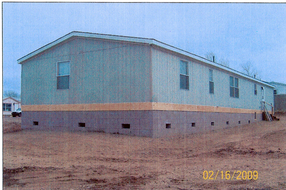
REAR VIEW (from right rear corner)