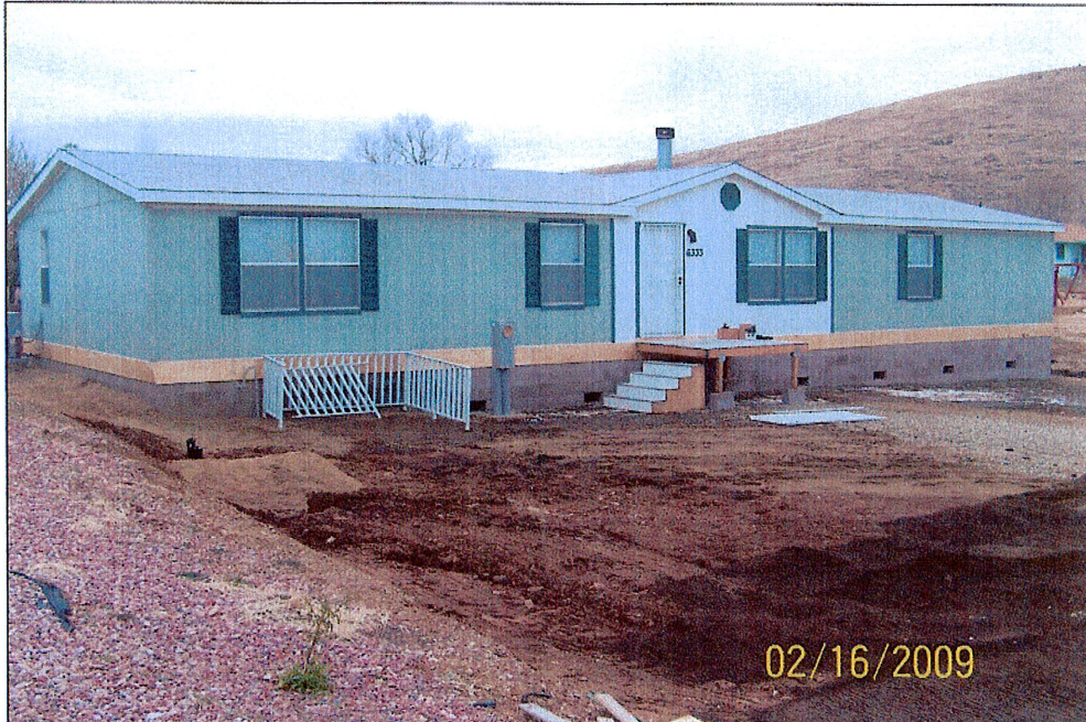
FRONT VIEW (from front left corner)

If using the Elevation Certificate to obtain NFIP flood insurance, affix at least two building photographs below according to the instructions for Item A6. Identify all photographs with: date taken; "Front View" and "Rear View"; and, if required, "Right Side View" and "Left Side View." If submitting more photographs than will fit on this page, use the Continuation Page, following.