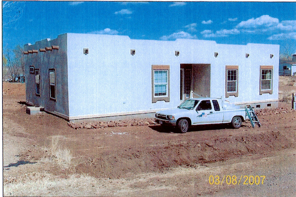
FRONT VIEW (from front left corner)

If using the Elevation Certificate to obtain NFIP flood insurance, affix at least two building photographs below according to the instructions for Item A6. Identify all photographs with: date taken; "Front View" and "Rear View"; and, if required, "Right Side View" and "Left Side View." If submitting more photographs than will fit on this page, use the Continuation Page, following.