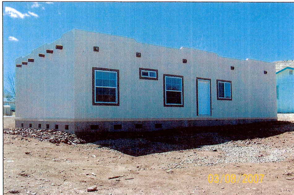
REAR VIEW (from right rear corner)