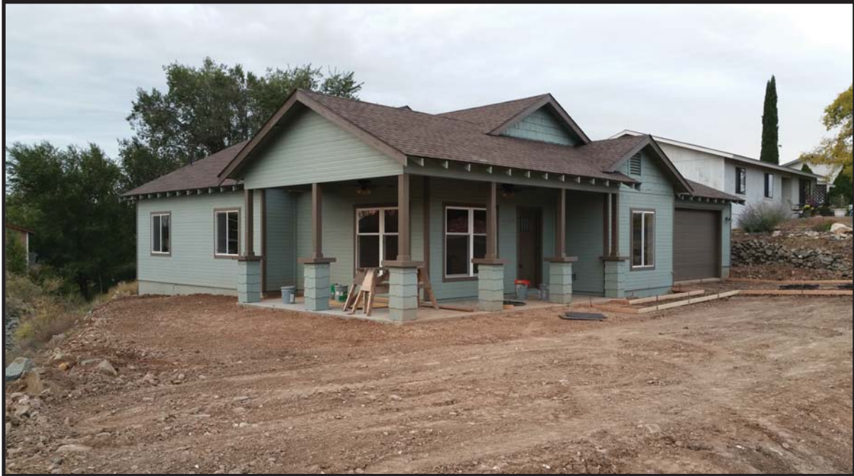
FRONT OF HOME, FROM FRONT LEFT CORNER

If using the Elevation Certificate to obtain NFIP flood insurance, affix at least 2 building photographs below according to the instructions for Item A6. Identify all photographs with date taken; "Front View" and "Rear View"; and, if required, "Right Side View" and "Left Side View." When applicable, photographs must show the foundation with representative examples of the flood openings or vents, as indicated in Section A8. If submitting more photographs than will fit on this page, use the Continuation Page.