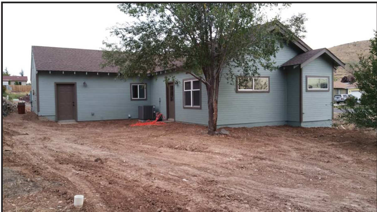
REAR OF HOME, FROM RIGHT REAR CORNER