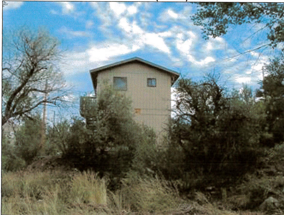
REAR VIEW (7/27/10)