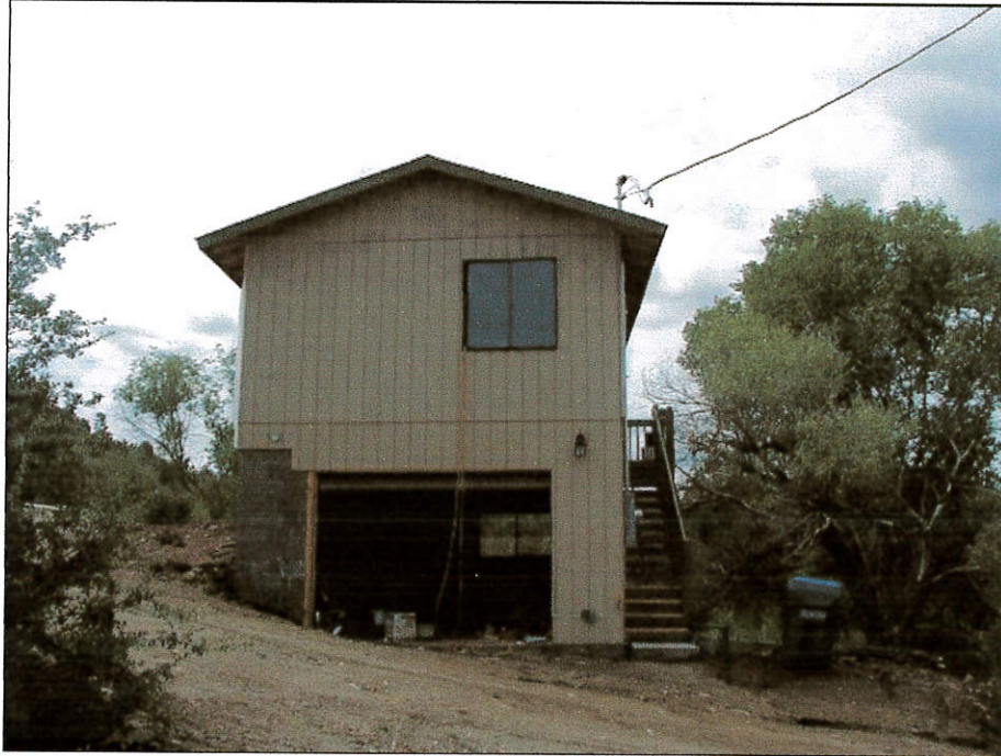
FRONT VIEW (7/27/10)

If using the Elevation Certificate to obtain NFIP flood insurance, affix at least two building photographs below according to the instructions for Item A6. Identify all photographs with: date taken; "Front View" and "Rear View"; and, if required, "Right Side View" and "Left Side View." If submitting more photographs than will fit on this page, use the Continuation Page, following.