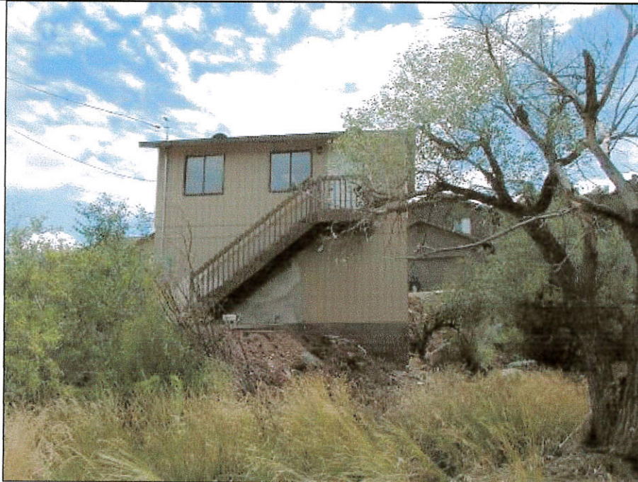
RIGHT SIDE VIEW (7/27/10)

If using the Elevation Certificate to obtain NFIP flood insurance, affix at least two building photographs below according to the instructions for Item A6. Identify all photographs with: date taken; "Front View" and "Rear View"; and, if required, "Right Side View" and "Left Side View." If submitting more photographs than will fit on this page, use the Continuation Page, following.