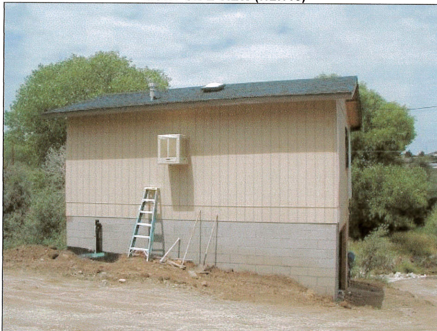
LEFT SIDE VIEW (7/27/10)