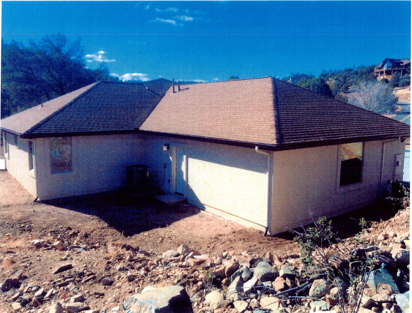
SOUTHWEST SIDE AND REAR OF RESIDENCE SHOWING A.C. UNIT PER C2E

If submitting more photographs than will fit on the preceding page, affix the additional photographs below. Identify all photographs with: date taken; "Front View" and "Rear View"; and, if required, "Right Side View" and "Left Side View." When applicable, photographs must show the foundation with representative examples of the flood openings or vents, as indicated in Section A8.