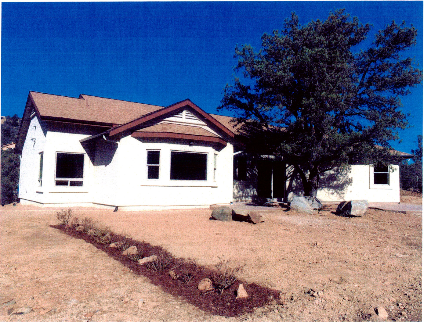
NORTH END AND WEST (STREET) SIDE OF RESIDENCE

If using the Elevation Certificate to obtain NFIP flood insurance, affix at least 2 building photographs below according to the instructions for Item A6. Identify all photographs with date taken; "Front View" and "Rear View"; and, if required, "Right Side View" and "Left Side View." When applicable, photographs must show the foundation with representative examples of the flood openings or vents, as indicated in Section A8. If submitting more photographs than will fit on this page, use the Continuation Page.