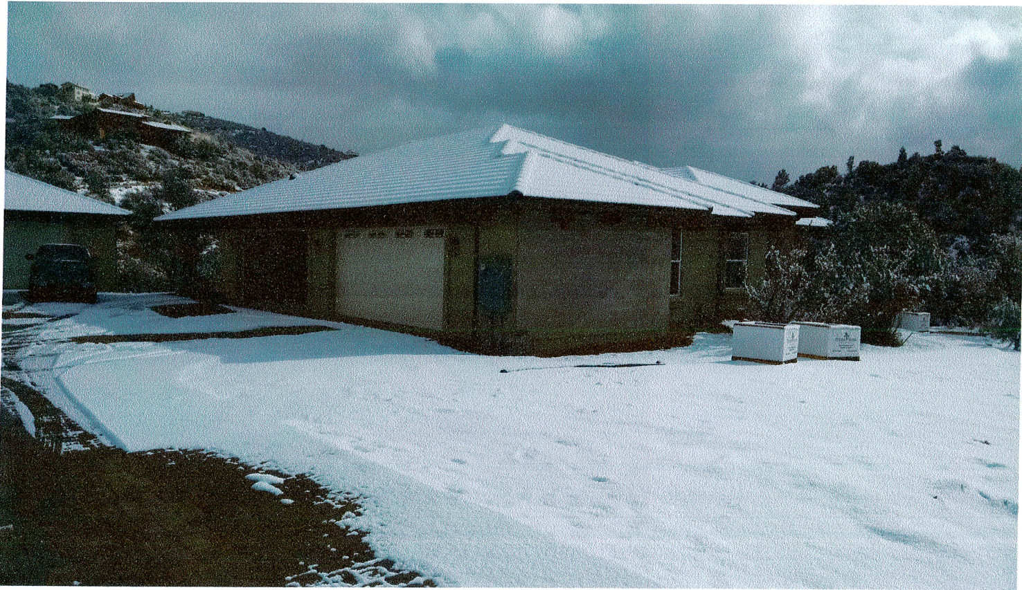
SOUTH END AND WEST (STREET) SIDE OF RESIDENCE – C2E AT ELECTRIC PANEL

If using the Elevation Certificate to obtain NFIP flood insurance, affix at least 2 building photographs below according to the instructions for Item A6. Identify all photographs with date taken; "Front View" and "Rear View"; and, if required, "Right Side View" and "Left Side View." When applicable, photographs must show the foundation with representative examples of the flood openings or vents, as indicated in Section A8. If submitting more photographs than will fit on this page, use the Continuation Page.