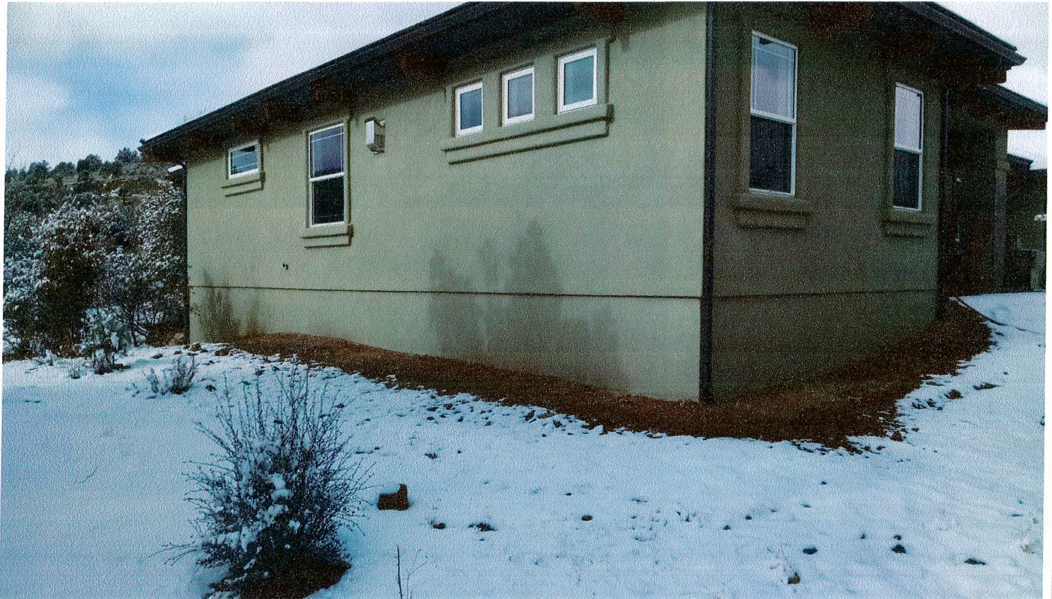
SOUTH & EAST SIDES

If submitting more photographs than will fit on the preceding page, affix the additional photographs below. Identify all photographs with: date taken; "Front View" and "Rear View"; and, if required, "Right Side View" and "Left Side View." When applicable, photographs must show the foundation with representative examples of the flood openings or vents, as indicated in Section A8.