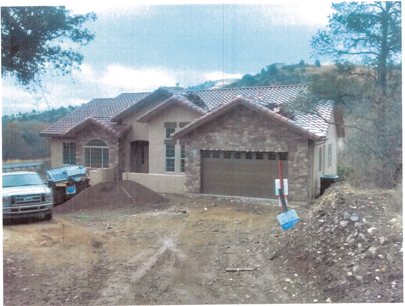
NORTH AND WEST (STREET) SIDES. C2E ON AC BASE AT RIGHT SIDE - 1-4-2016

If using the Elevation Certificate to obtain NFIP flood insurance, affix at least 2 building photographs below according to the instructions for Item A6. Identify all photographs with date taken; "Front View" and "Rear View"; and, if required, "Right Side View" and "Left Side View." When applicable, photographs must show the foundation with representative examples of the flood openings or vents, as indicated in Section A8. If submitting more photographs than will fit on this page, use the Continuation Page.