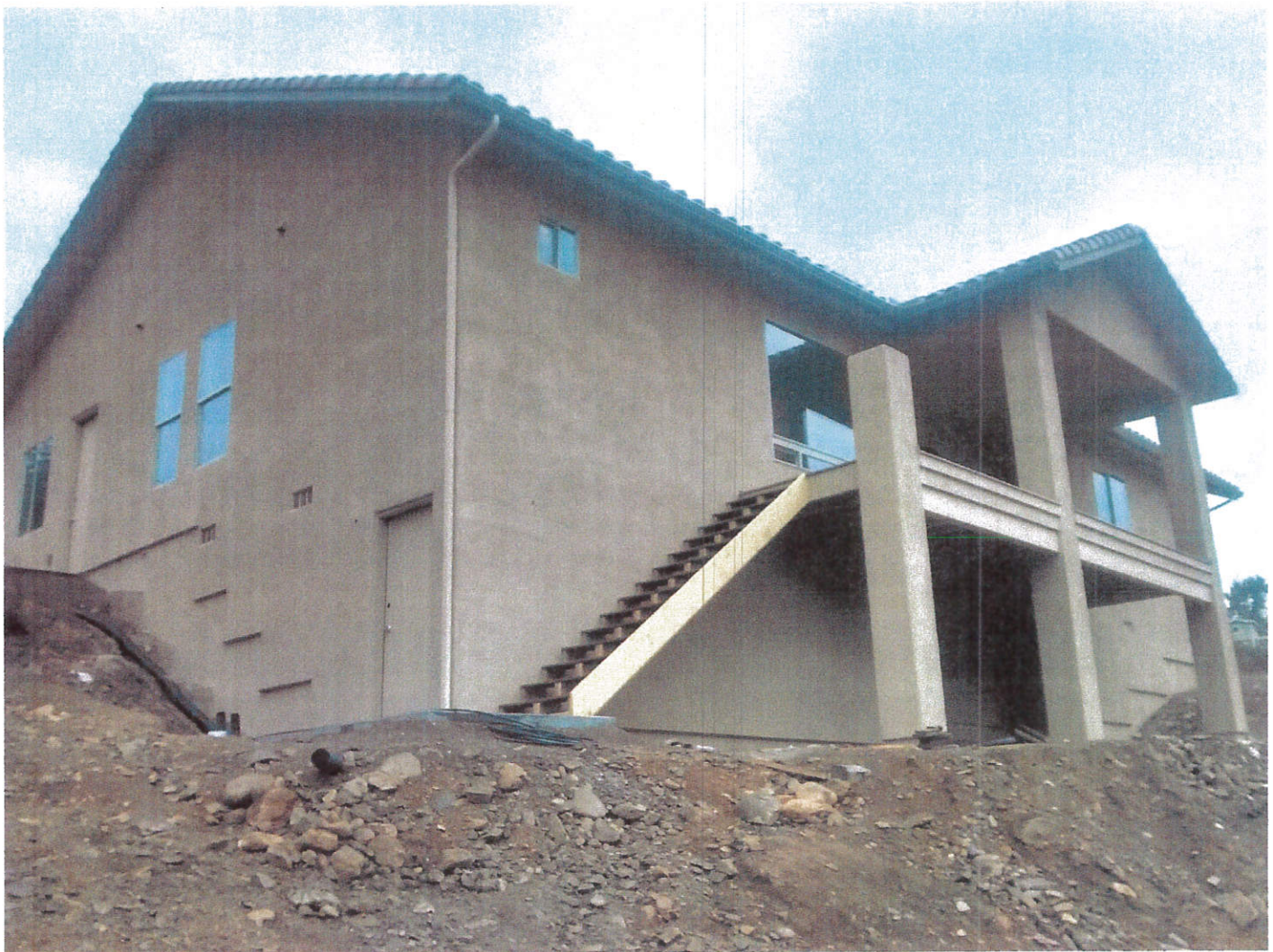
SOUTH & EAST (CREEK) SIDES. - 1-4-2016

If submitting more photographs than will fit on the preceding page, affix the additional photographs below. Identify all photographs with: date taken; "Front View" and "Rear View"; and, if required, "Right Side View" and "Left Side View." When applicable, photographs must show the foundation with representative examples of the flood openings or vents, as indicated in Section A8.