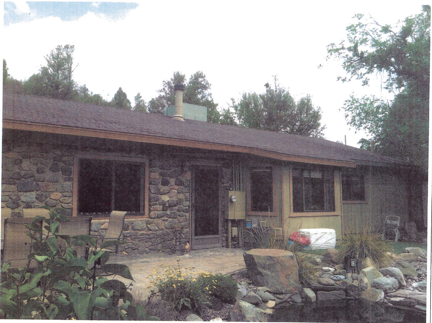
EAST (CREEK) SIDE OF RESIDENCE 7-17-2015

If using the Elevation Certificate to obtain NFIP flood insurance, affix at least 2 building photographs below according to the instructions for Item A6. Identify all photographs with date taken; "Front View" and "Rear View"; and, if required, "Right Side View" and "Left Side View." When applicable, photographs must show the foundation with representative examples of the flood openings or vents, as indicated in Section A8. If submitting more photographs than will fit on this page, use the Continuation Page.