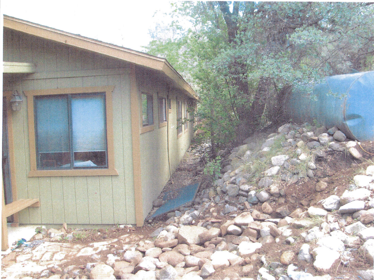
PORTION OF NORTH END & WEST SIDE OF RESIDENCE 7-17-15

If submitting more photographs than will fit on the preceding page, affix the additional photographs below. Identify all photographs with: date taken; "Front View" and "Rear View"; and, if required, "Right Side View" and "Left Side View." When applicable, photographs must show the foundation with representative examples of the flood openings or vents, as indicated in Section A8.