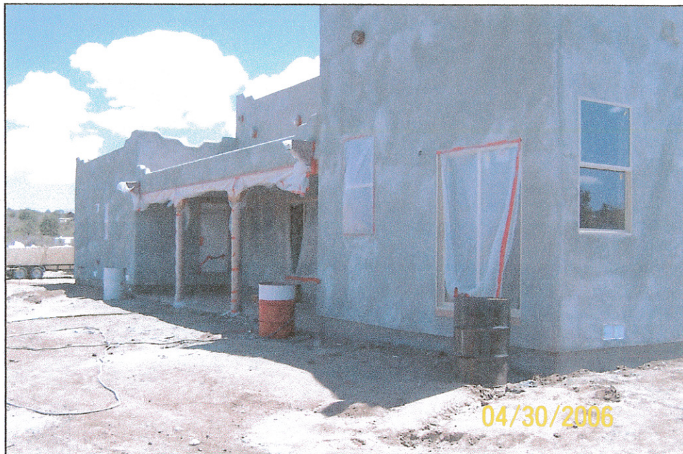
REAR VIEW (FROM LEFT REAR CORNER)