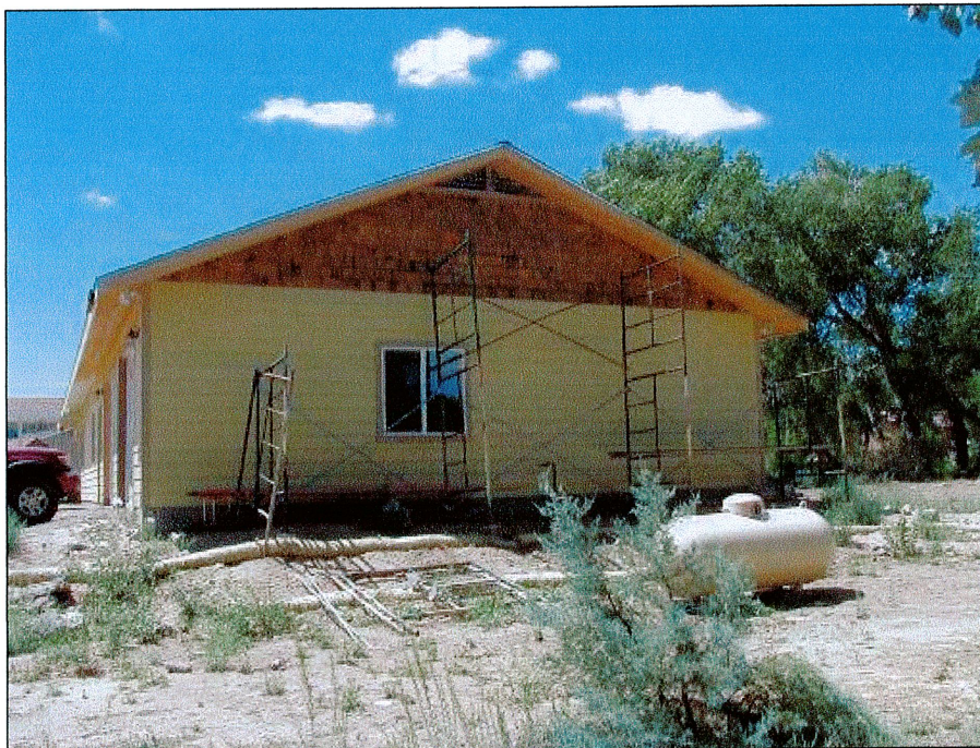
Right Side View – July 12, 2011