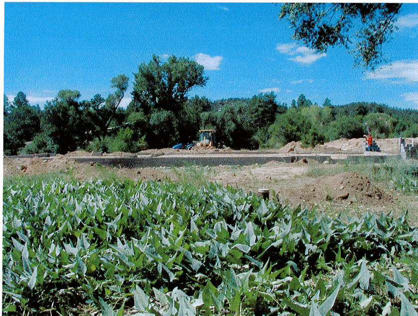
North Elevation – August 11, 2010