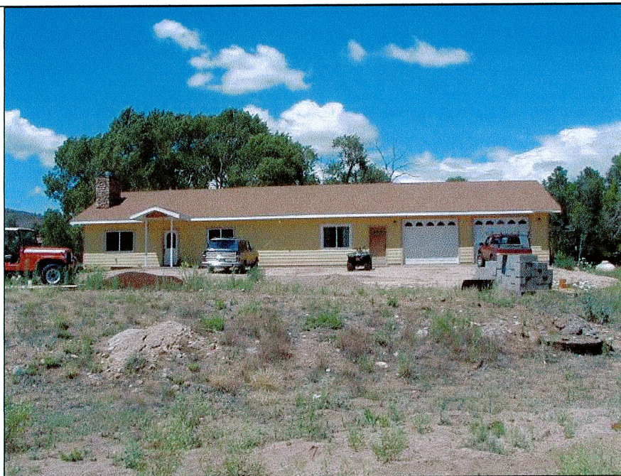
Front View – July 12, 2011

If using the Elevation Certificate to obtain NFIP flood insurance, affix at least two building photographs below according to the instructions for Item A6. Identify all photographs with: date taken; "Front View" and "Rear View"; and, if required, "Right Side View" and "Left Side View." If submitting more photographs than will fit on this page, use the Continuation Page, following.