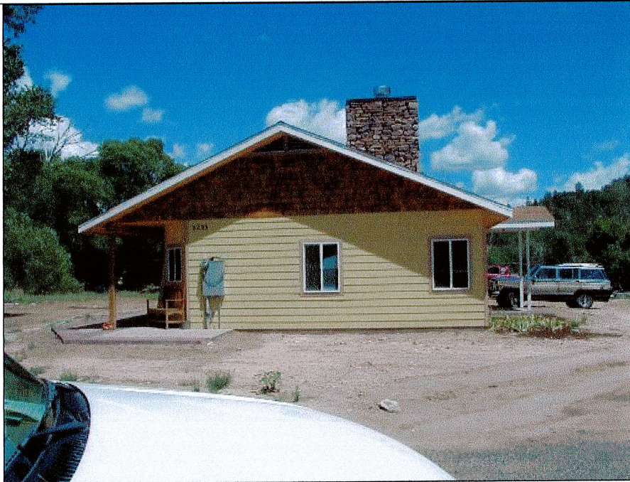
Left Side View – July 12, 2011

If using the Elevation Certificate to obtain NFIP flood insurance, affix at least two building photographs below according to the instructions for Item A6. Identify all photographs with: date taken; "Front View" and "Rear View"; and, if required, "Right Side View" and "Left Side View." If submitting more photographs than will fit on this page, use the Continuation Page, following.