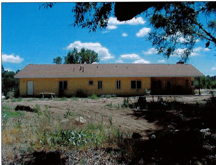
Rear View – July 12, 2011