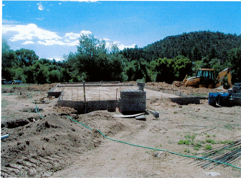
West Elevation – August 11, 2010

If using the Elevation Certificate to obtain NFIP flood insurance, affix at least two building photographs below according to the instructions for Item A6. Identify all photographs with: date taken; "Front View" and "Rear View"; and, if required, "Right Side View" and "Left Side View." If submitting more photographs than will fit on this page, use the Continuation Page, following.