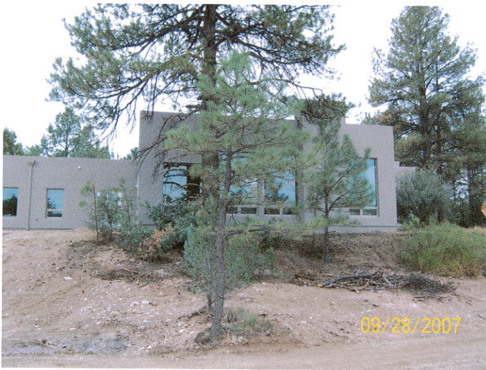
Front right view