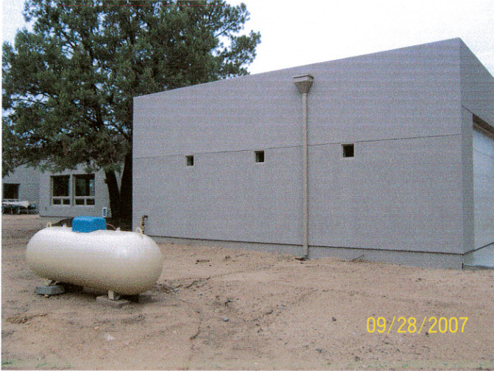
Rear right view