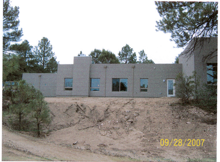
Front left view