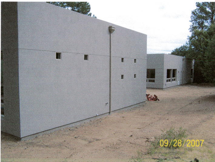
Rear left view