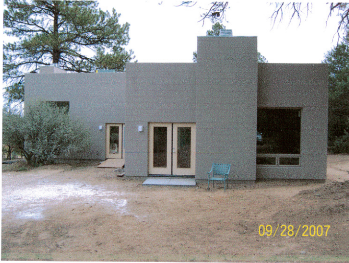
Right side view