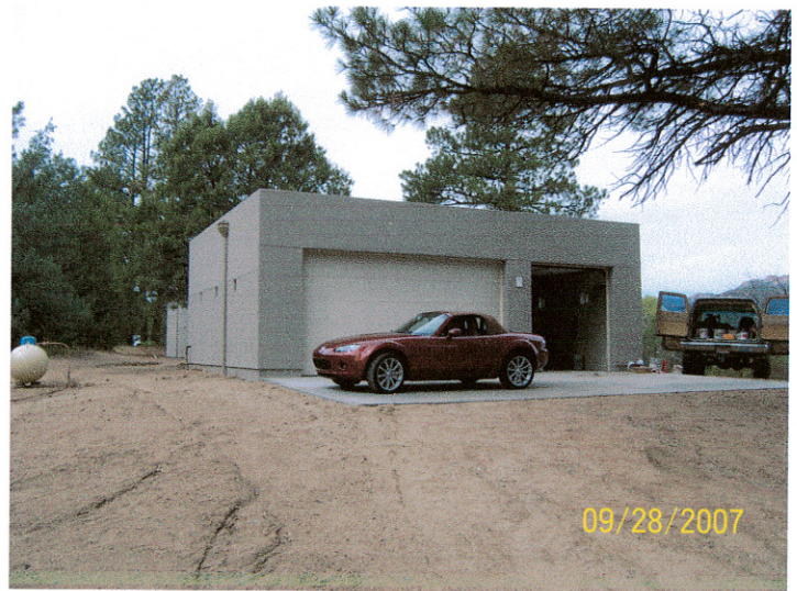
Left side view