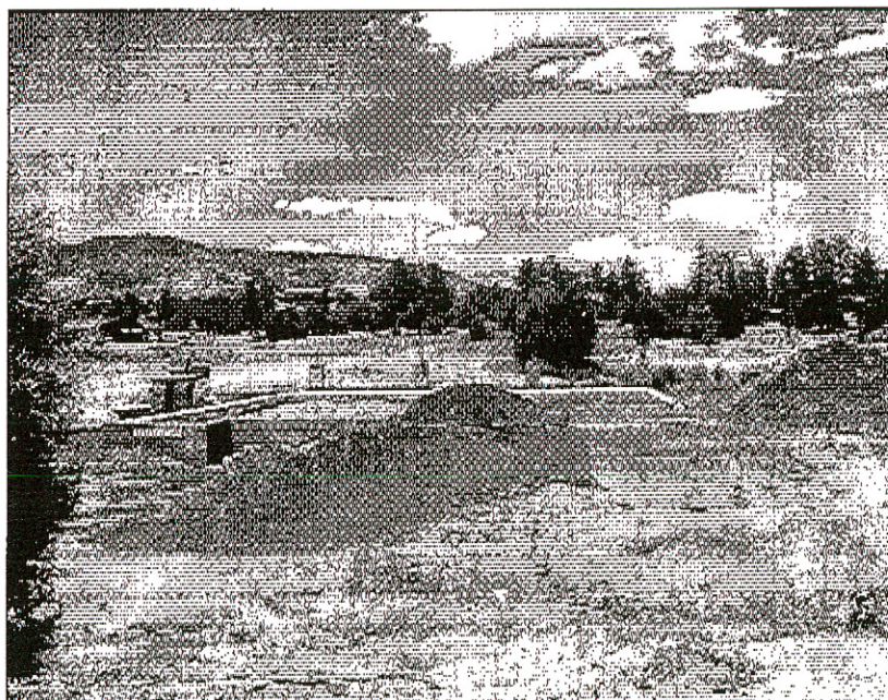
REAR VIEW – SOUTH ELEVATION (June 3, 2009)