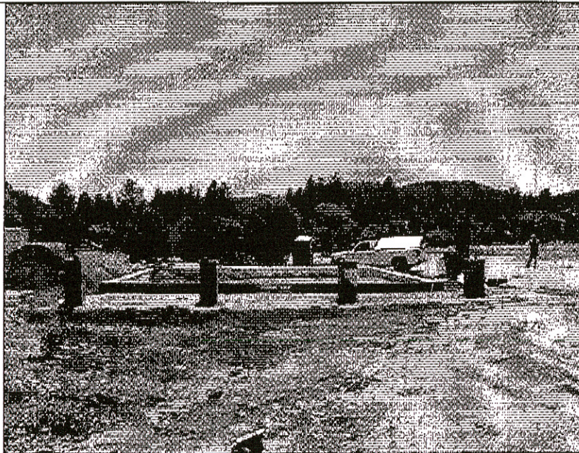
FRONT VIEW – NORTH ELEVATION (June 3, 2009)