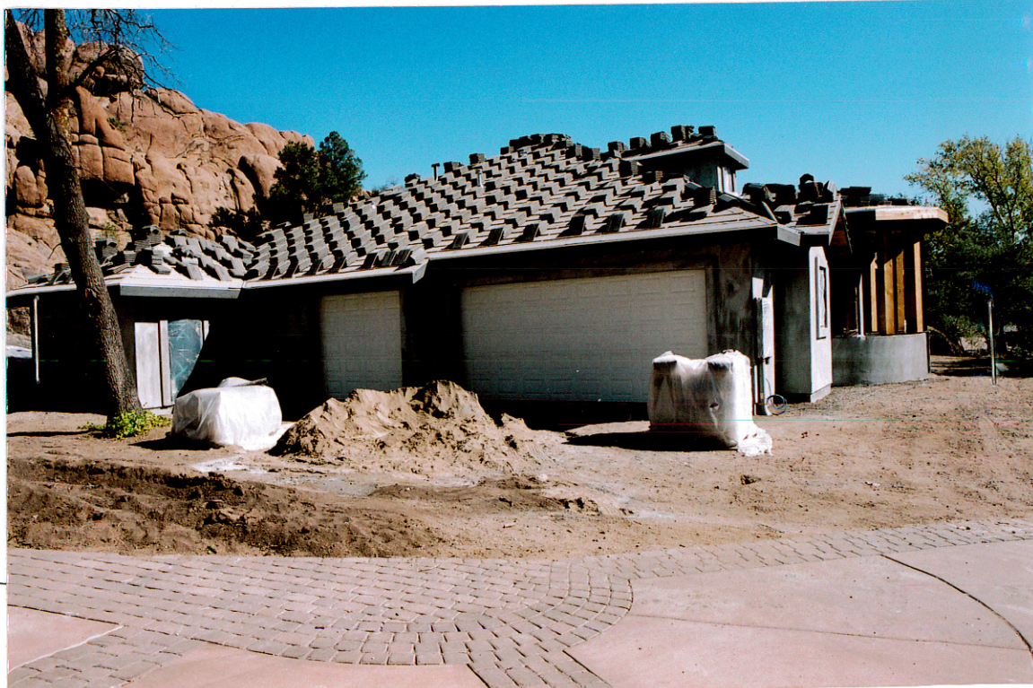
LEFT ELEVATION NOV. 3, 2007