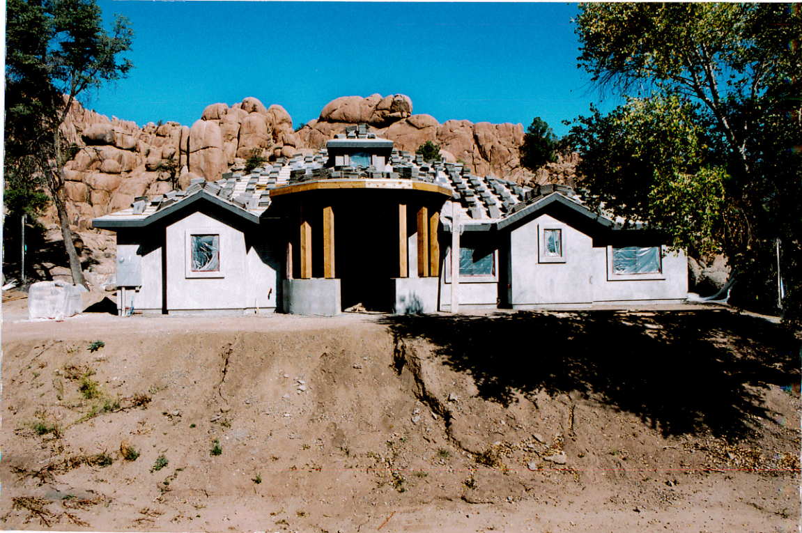
FRONT ELEVATION NOV. 3, 2007

If using the Elevation Certificate to obtain NFIP flood insurance, affix at least two building photographs below according to the instructions for Item A6. Identify all photographs with: date taken; "Front View" and "Rear View"; and, if required, "Right Side View" and "Left Side View." If submitting more photographs than will fit on this page, use the Continuation Page, following.