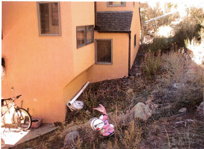
HAG at North face of existing house