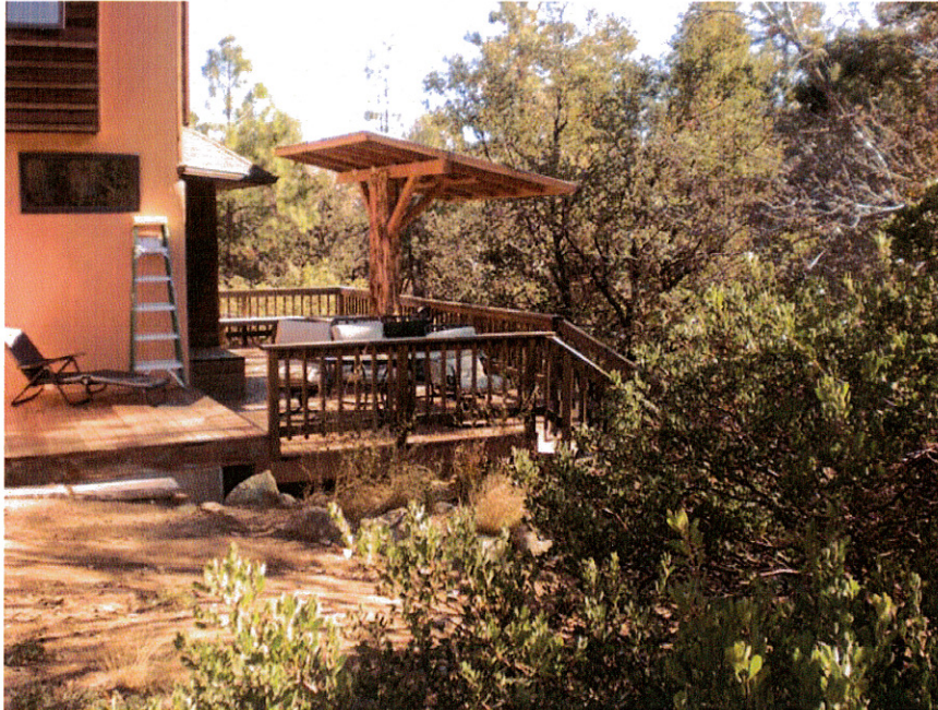
South West corner of the house facing east