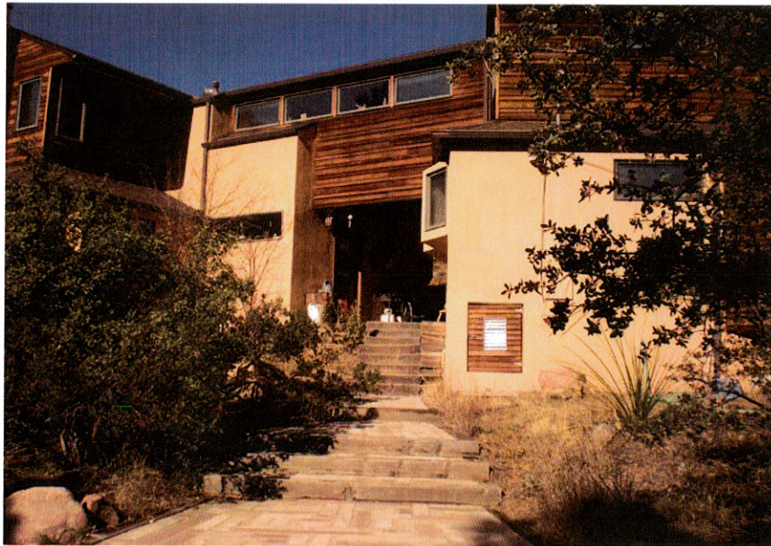
Front view facing North