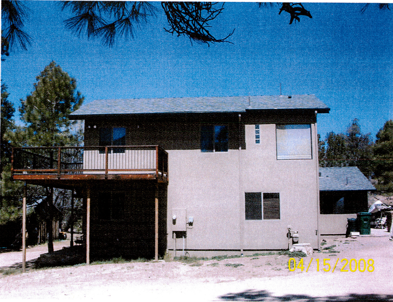
Right side view (S.E. face)