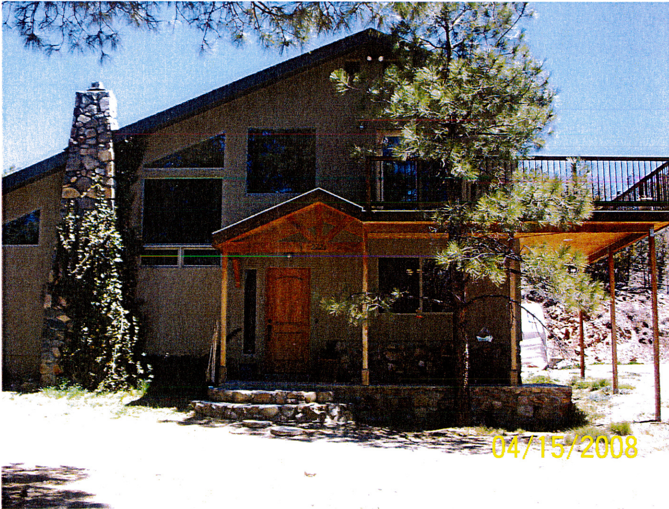
Front View (house faces S.W.)

If using the Elevation Certificate to obtain NFIP flood insurance, affix at least two building photographs below according to the instructions for Item A6. Identify all photographs with: date taken; "Front View" and "Rear View"; and, if required, "Right Side View" and "Left Side View." If submitting more photographs than will fit on this page, use the Continuation Page, following.