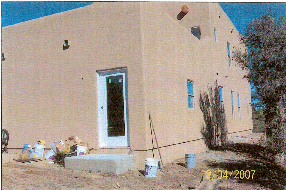
REAR VIEW (FROM RIGHT REAR CORNER OF GARAGE)