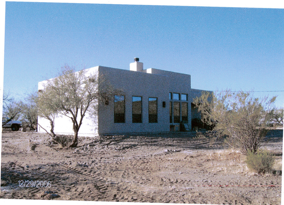
NORTH SIDE OF HOUSE

If submitting more photographs than will fit on the preceding page, affix the additional photographs below. Identify all photographs with: date taken; "Front View" and "Rear View"; and, if required, "Right Side View" and "Left Side View."