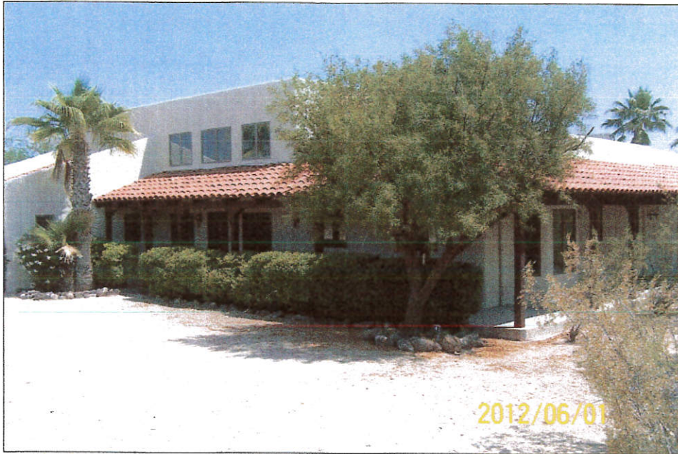
FRONT VIEW (from front right)

If using the Elevation Certificate to obtain NFIP flood insurance, affix at least two building photographs below according to the instructions for Item A6. Identify all photographs with: date taken; "Front View" and "Rear View"; and, if required, "Right Side View" and "Left Side View." If submitting more photographs than will fit on this page, use the Continuation Page on the reverse.