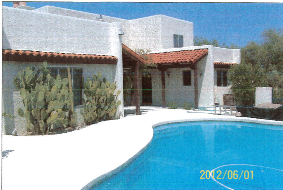
REAR VIEW (from right rear)