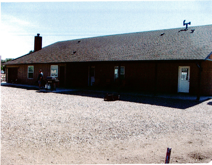
REAR VIEW (WEST SIDE) OF CONSTRUCTED HOUSE TAKEN 6-02-2013

If using the Elevation Certificate to obtain NFIP flood insurance, affix at least 2 building photographs below according to the instructions for Item A6. Identify all photographs with date taken; "Front View" and "Rear View"; and, if required, "Right Side View" and "Left Side View." When applicable, photographs must show the foundation with representative examples of the flood openings or vents, as indicated in Section A8. If submitting more photographs than will fit on this page, use the Continuation Page.