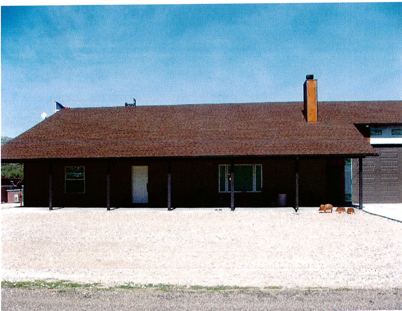
FRONT VIEW (EAST SIDE) OF CONSTRUCTED HOUSE TAKEN 6-02-2013