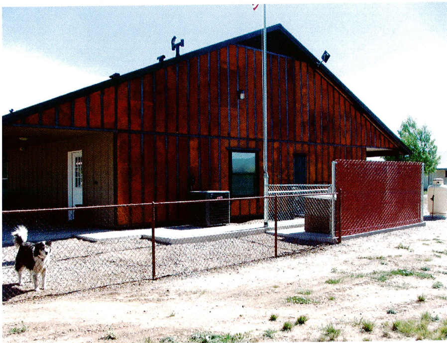
LEFT VIEW (SOUTH SIDE) OF CONSTRUCTED HOUSE TAKEN 6-02-2013