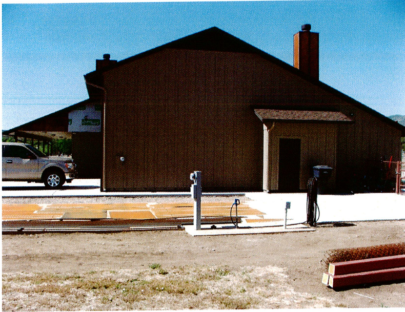
RIGHT VIEW (NORTH SIDE) OF CONSTRUCTED HOUSE TAKEN 6-02-2013

If submitting more photographs than will fit on the preceding page, affix the additional photographs below. Identify all photographs with: date taken; "Front View" and "Rear View"; and, if required, "Right Side View" and "Left Side View." When applicable, photographs must show the foundation with representative examples of the flood openings or vents, as indicated in Section A8.