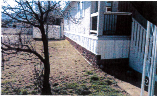
Left Side - 3/03/15