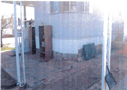
Front Corner - 3/03/15