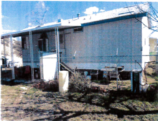
Side - 3/03/15