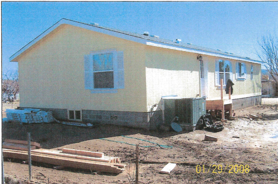
REAR VIEW (from right rear corner)