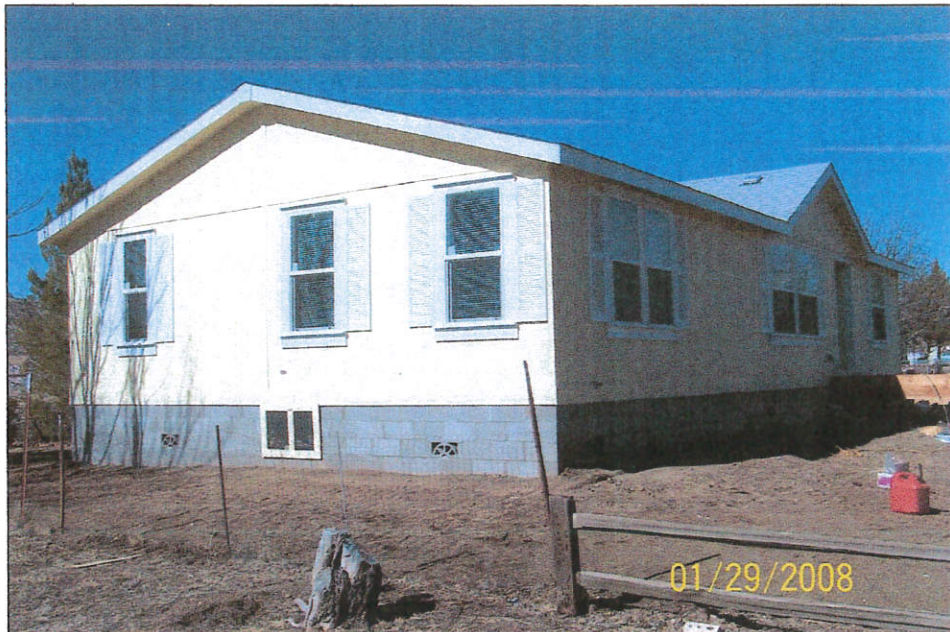
FRONT VIEW (from front left corner)

If using the Elevation Certificate to obtain NFIP flood insurance, affix at least two building photographs below according to the instructions for Item A6. Identify all photographs with: date taken; "Front View" and "Rear View"; and, if required, "Right Side View" and "Left Side View." If submitting more photographs than will fit on this page, use the Continuation Page, following.