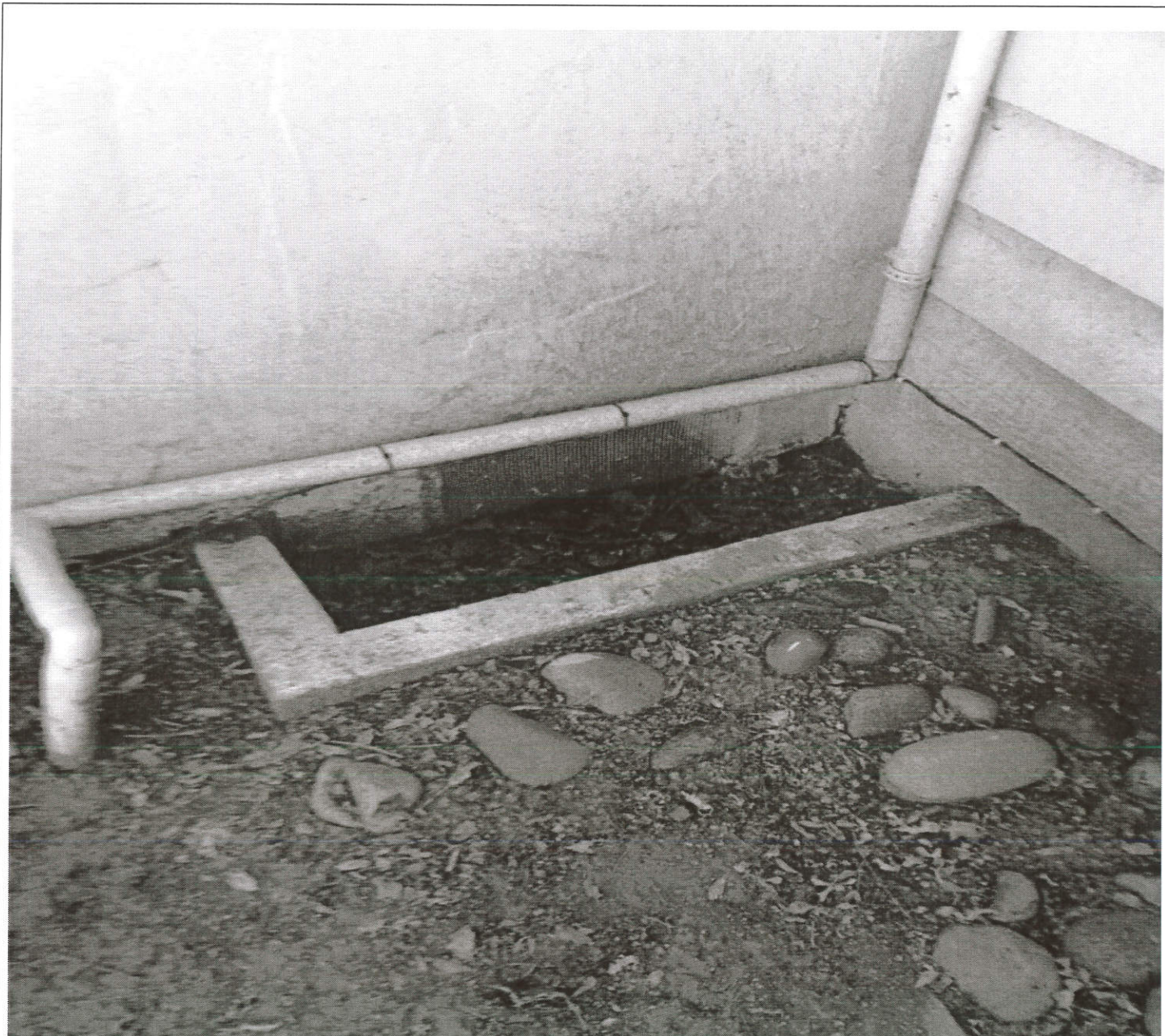
Flood opening on the North West corner of the house

If submitting more photographs than will fit on the preceding page, affix the additional photographs below. Identify all photographs with: date taken; "Front View" and "Rear View"; and, if required, "Right Side View" and "Left Side View." When applicable, photographs must show the foundation with representative examples of the flood openings or vents, as indicated in Section A8.