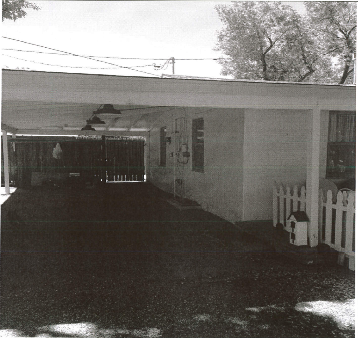
North East corner of the house (Flood opening)

If using the Elevation Certificate to obtain NFIP flood insurance, affix at least 2 building photographs below according to the instructions for Item A6. Identify all photographs with date taken; "Front View" and "Rear View"; and, if required, "Right Side View" and "Left Side View." When applicable, photographs must show the foundation with representative examples of the flood openings or vents, as indicated in Section A8. If submitting more photographs than will fit on this page, use the Continuation Page.