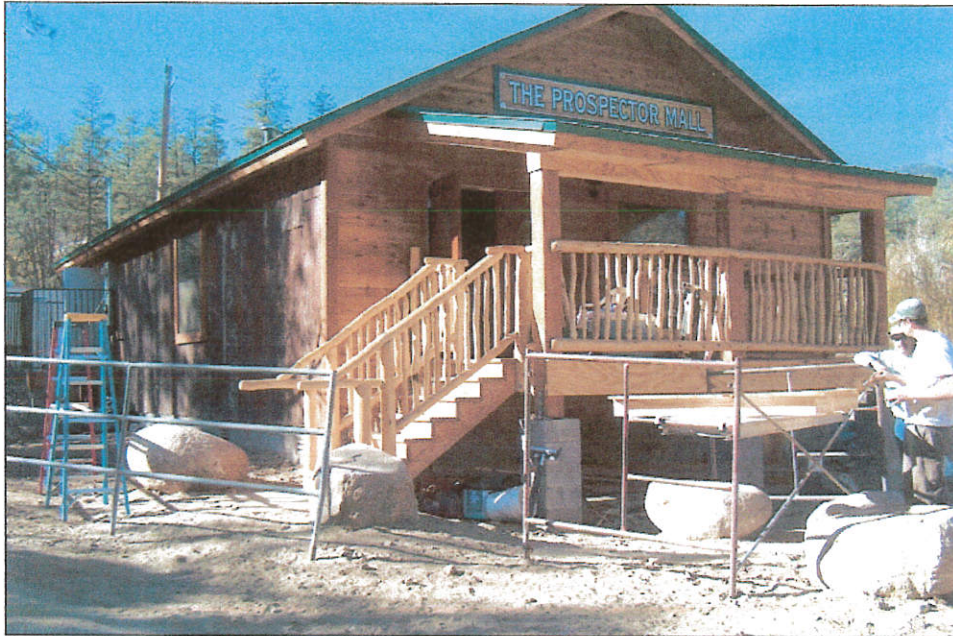
FRONT VIEW (FROM FRONT LEFT CORNER)

If using the Elevation Certificate to obtain NFIP flood insurance, affix at least two building photographs below according to the instructions for Item A6. Identify all photographs with: date taken; "Front View" and "Rear View"; and, if required, "Right Side View" and "Left Side View." If submitting more photographs than will fit on this page, use the Continuation Page, following.