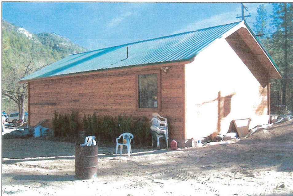
REAR VIEW (FROM RIGHT REAR CORNER)