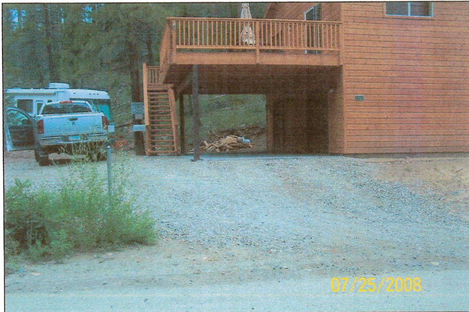
FRONT VIEW (FROM FRONT LEFT CORNER)

If using the Elevation Certificate to obtain NFIP flood insurance, affix at least two building photographs below according to the instructions for Item A6. Identify all photographs with: date taken; "Front View" and "Rear View"; and, if required, "Right Side View" and "Left Side View." If submitting more photographs than will fit on this page, use the Continuation Page, following.