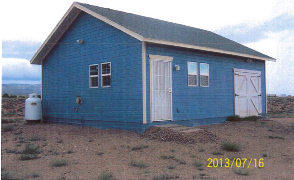
FRONT OF HOME, FROM FRONT LEFT CORNER

If using the Elevation Certificate to obtain NFIP flood insurance, affix at least 2 building photographs below according to the instructions for Item A6. Identify all photographs with date taken; "Front View" and "Rear View"; and, if required, "Right Side View" and "Left Side View." When applicable, photographs must show the foundation with representative examples of the flood openings or vents, as indicated in Section A8. If submitting more photographs than will fit on this page, use the Continuation Page.