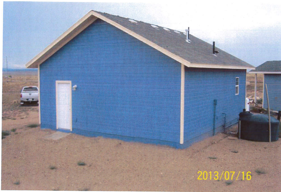
REAR OF HOME, FROM RIGHT REAR CORNER