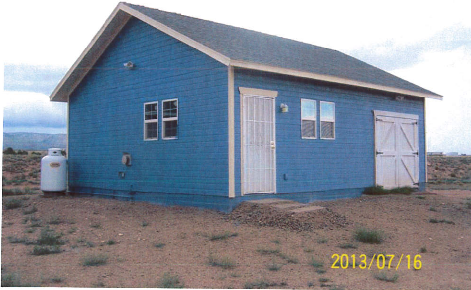
FRONT OF HOME, FROM FRONT LEFT CORNER

If using the Elevation Certificate to obtain NFIP flood insurance, affix at least 2 building photographs below according to the instructions for Item A6. Identify all photographs with date taken; "Front View" and "Rear View"; and, if required, "Right Side View" and "Left Side View." When applicable, photographs must show the foundation with representative examples of the flood openings or vents, as indicated in Section A8. If submitting more photographs than will fit on this page, use the Continuation Page.