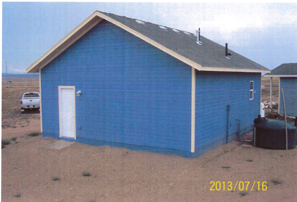
REAR OF HOME, FROM RIGHT REAR CORNER