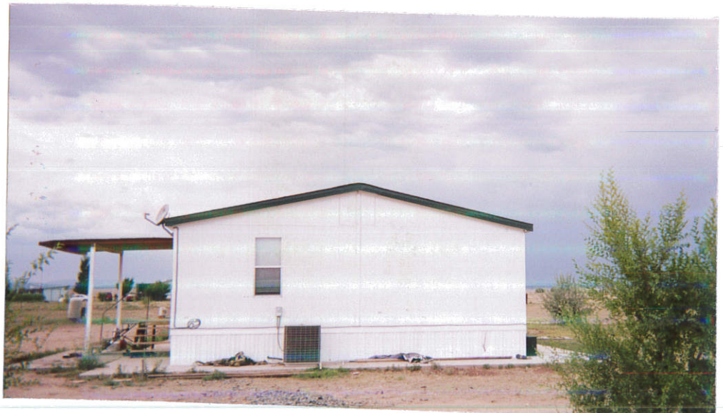
EAST END OF RESIDENCE W/ PERFORATED SKIRT. HEAT PUMP ON CONC. SLAB BELOW B.F.E.