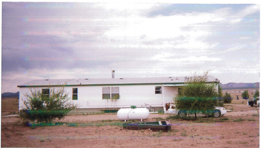
SOUTH SIDE OF RESIDENCE SHOWING MASONRY WALL