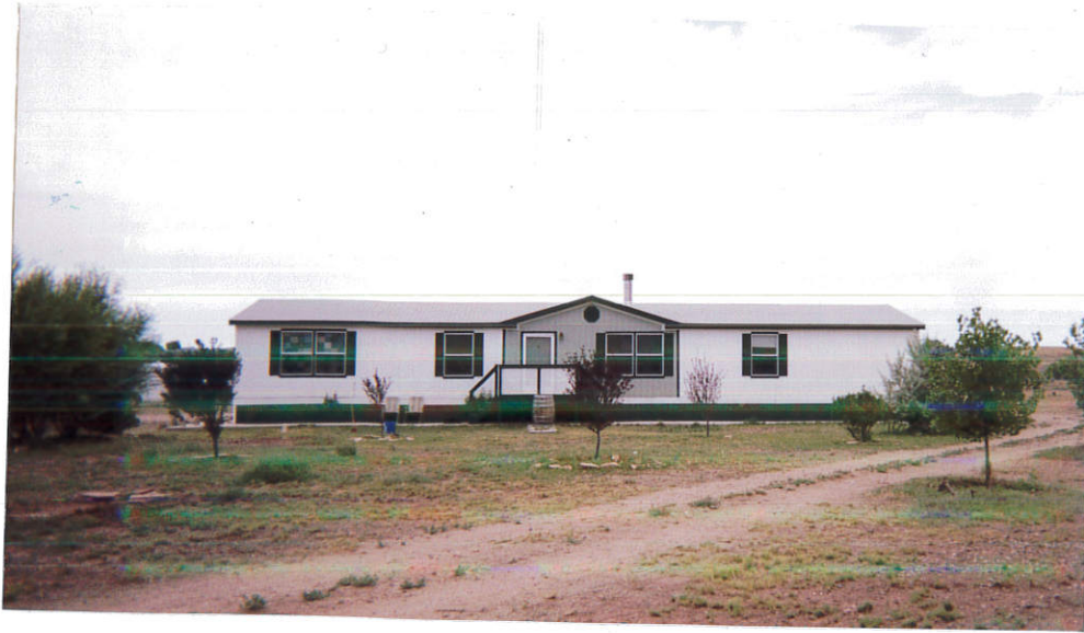
NORTH SIDE OF RESIDENCE SHOWING MASONRY WALL.

If using the Elevation Certificate to obtain NFIP flood insurance, affix at least two building photographs below according to the instructions for Item A6. Identify all photographs with: date taken; "Front View" and "Rear View"; and, if required, "Right Side View" and "Left Side View." If submitting more photographs than will fit on this page, use the Continuation Page, following.