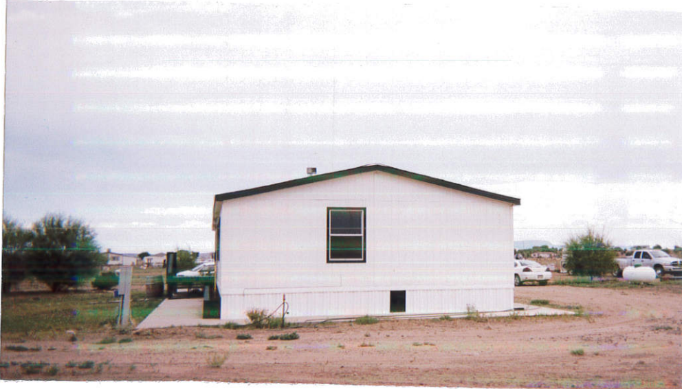
WEST END OF RESIDENCE W/ ONE LARGE OPENING AND PERFORATED METAL SKIRT

If submitting more photographs than will fit on the preceding page, affix the additional photographs below. Identify all photographs with: date taken; "Front View" and "Rear View"; and, if required, "Right Side View" and "Left Side View."