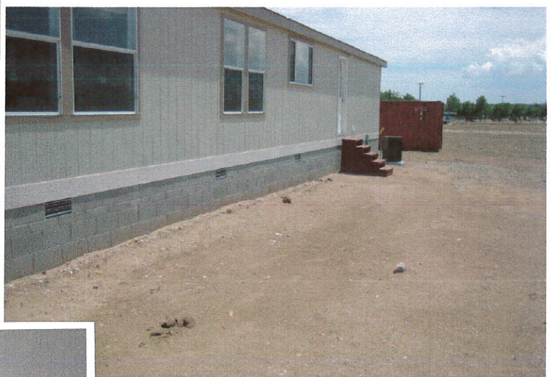
VIEW OF S.E. SIDE →