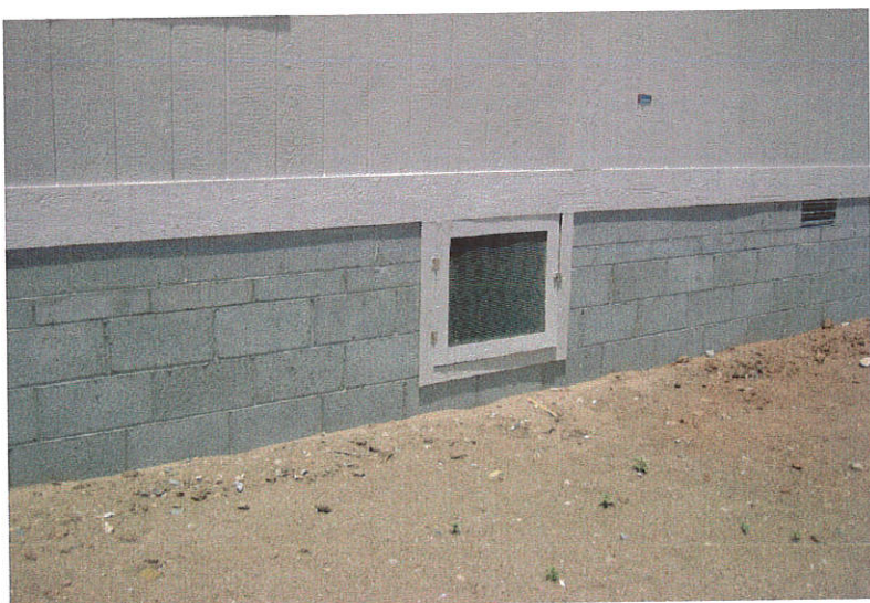
TYPICAL PERMANENT OPENING ←