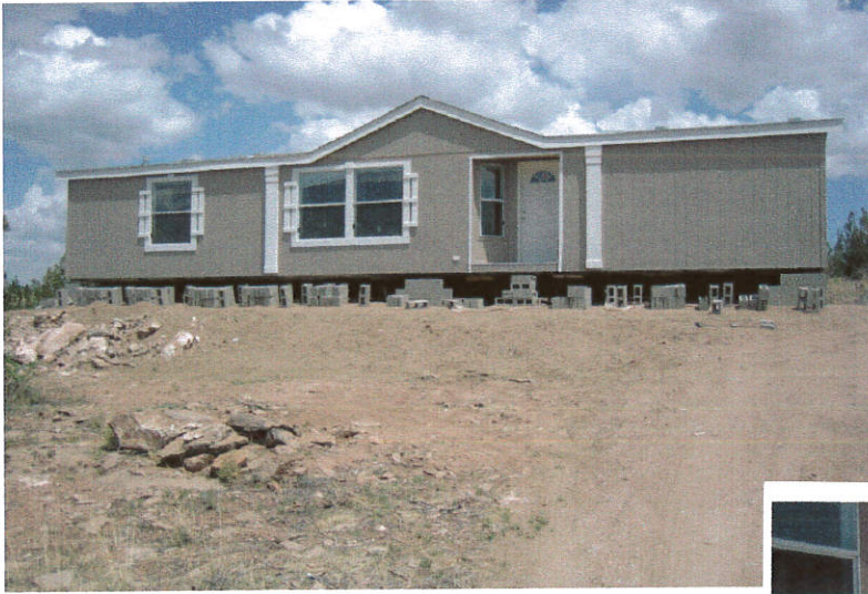
VIEW OF N.W. SIDE ←

If using the Elevation Certificate to obtain NFIP flood insurance, affix at least two building photographs below according to the instructions for Item A6. Identify all photographs with: date taken; "Front View" and "Rear View"; and, if required, "Right Side View" and "Left Side View." If submitting more photographs than will fit on this page, use the Continuation Page, following.