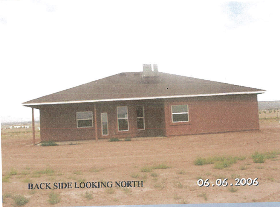
BACK SIDE LOOKING NORTH