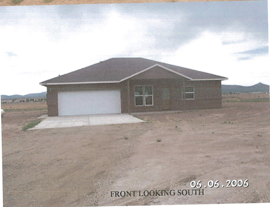
FRONT LOOKING SOUTH