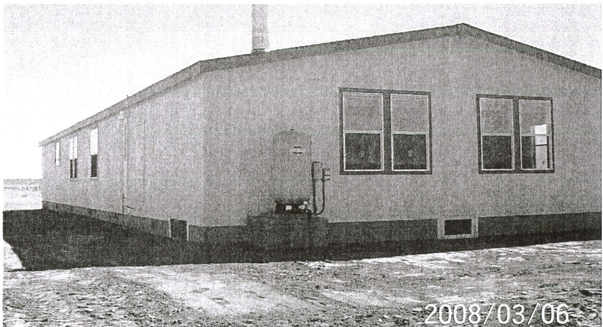
W. Side View: N. Rear View (Long)