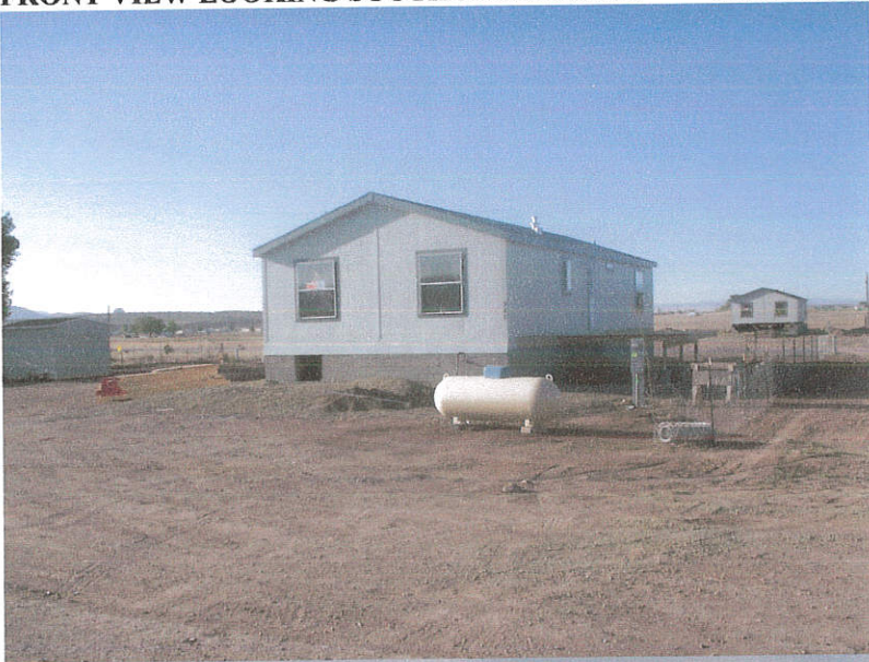
FRONT VIEW LOOKING SOUTH FROM ROAD PHOTOS TAKEN 5-15-2006

If using the Elevation Certificate to obtain NFIP flood insurance, affix at least two building photographs below according to the instructions for Item A6. Identify all photographs with: date taken; "Front View" and "Rear View"; and, if required, "Right Side View" and "Left Side View." If submitting more photographs than will fit on this page, use the Continuation Page, following.