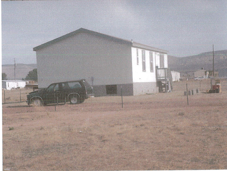
REAR VIEW LOOKING NORTH