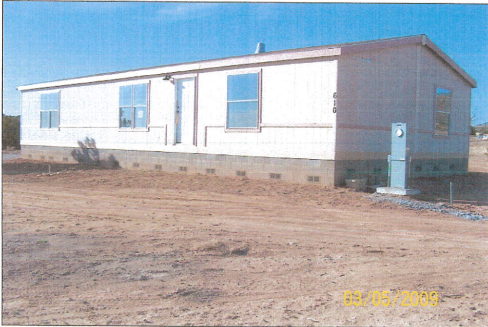
FRONT VIEW (from front right corner)

If using the Elevation Certificate to obtain NFIP flood insurance, affix at least two building photographs below according to the instructions for Item A6. Identify all photographs with: date taken; "Front View" and "Rear View"; and, if required, "Right Side View" and "Left Side View." If submitting more photographs than will fit on this page, use the Continuation Page, following.