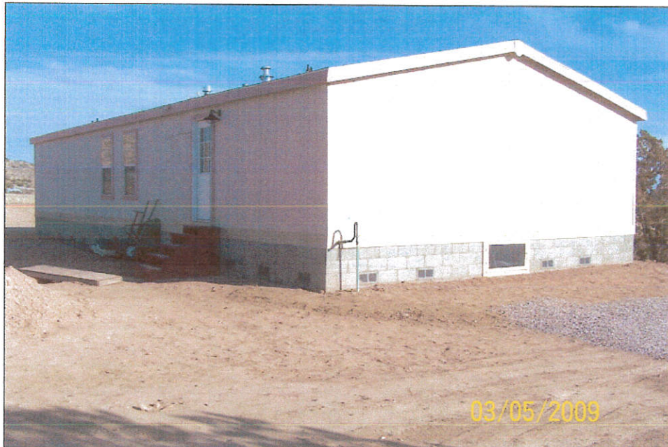
REAR VIEW (from left rear corner)