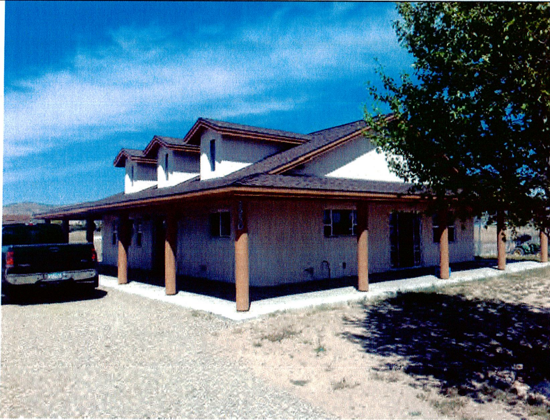
FRONT AND SOUTH SIDE OF HOUSE LOOKING

If using the Elevation Certificate to obtain NFIP flood insurance, affix at least 2 building photographs below according to the instructions for Item A6. Identify all photographs with date taken; "Front View" and "Rear View"; and, if required, "Right Side View" and "Left Side View." When applicable, photographs must show the foundation with representative examples of the flood openings or vents, as indicated in Section A8. If submitting more photographs than will fit on this page, use the Continuation Page.