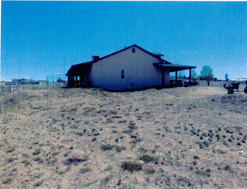
REAR AND NORTH SIDE OF HOUSE LOOKING