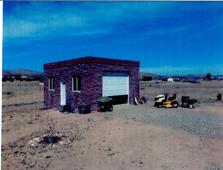
FRONT AND SOUTH SIDE OF STORAGE SHED

If submitting more photographs than will fit on the preceding page, affix the additional photographs below. Identify all photographs with: date taken; "Front View" and "Rear View"; and, if required, "Right Side View" and "Left Side View." When applicable, photographs must show the foundation with representative examples of the flood openings or vents, as indicated in Section A8.