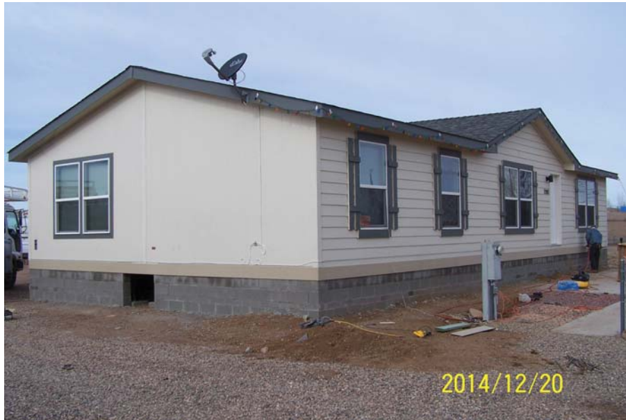
FRONT OF HOME, FROM FRONT LEFT CORNER

If using the Elevation Certificate to obtain NFIP flood insurance, affix at least 2 building photographs below according to the instructions for Item A6. Identify all photographs with date taken; "Front View" and "Rear View"; and, if required, "Right Side View" and "Left Side View." When applicable, photographs must show the foundation with representative examples of the flood openings or vents, as indicated in Section A8. If submitting more photographs than will fit on this page, use the Continuation Page.