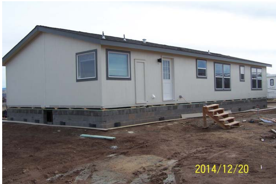
REAR OF HOME, FROM RIGHT REAR CORNER