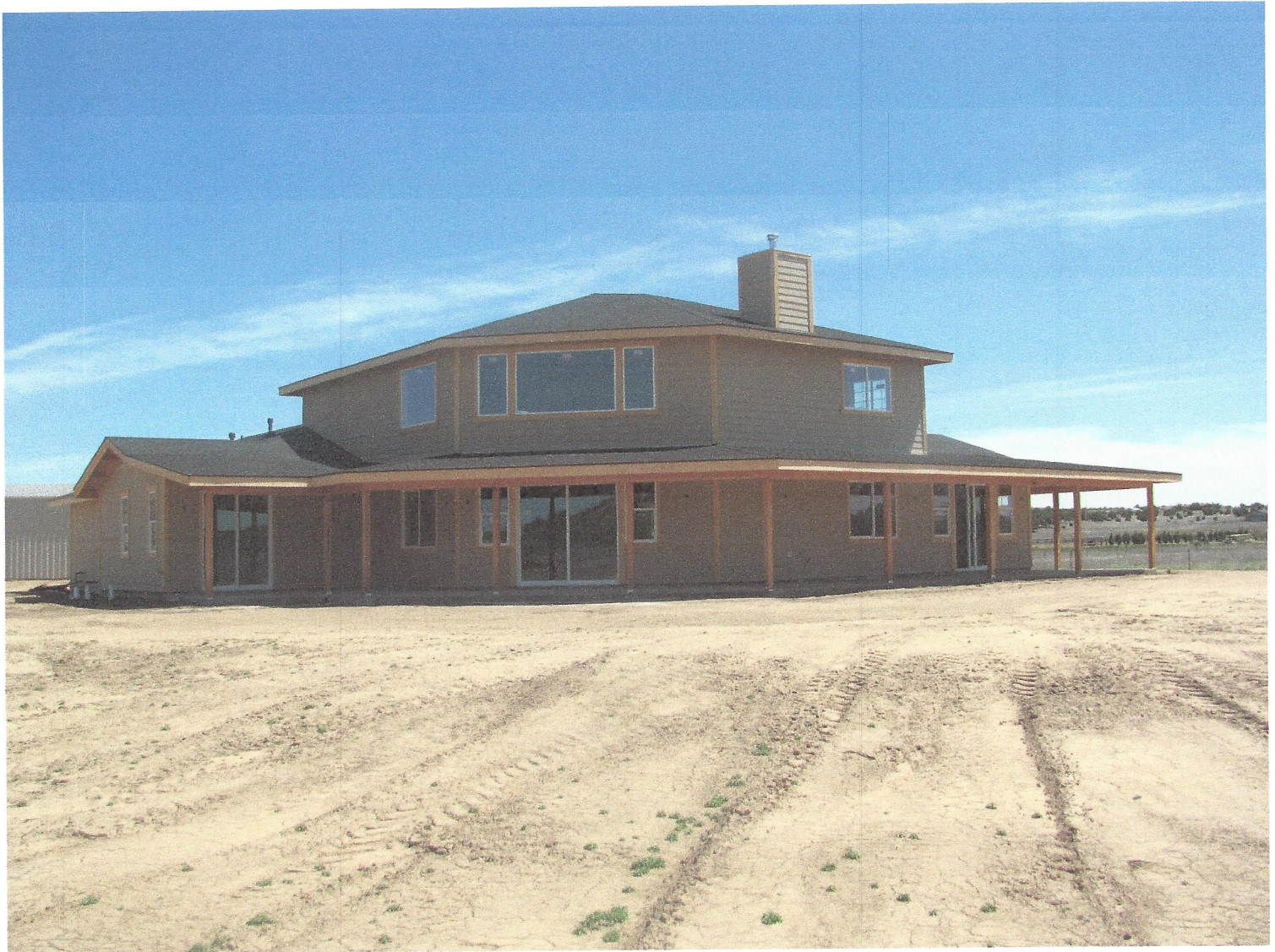
NORTHEAST (CENTER) – NORTH & WEST SIDES OF RESIDENCE

If using the Elevation Certificate to obtain NFIP flood insurance, affix at least 2 building photographs below according to the instructions for Item A6. Identify all photographs with date taken; "Front View" and "Rear View"; and, if required, "Right Side View" and "Left Side View." When applicable, photographs must show the foundation with representative examples of the flood openings or vents, as indicated in Section A8. If submitting more photographs than will fit on this page, use the Continuation Page.