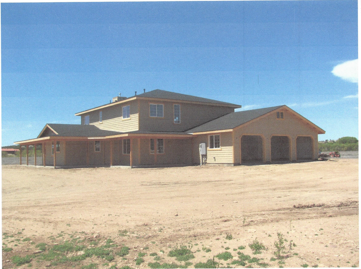
EAST(GARAGE) - SOUTH SIDE OF RESIDENCE

If submitting more photographs than will fit on the preceding page, affix the additional photographs below. Identify all photographs with: date taken; "Front View" and "Rear View"; and, if required, "Right Side View" and "Left Side View." When applicable, photographs must show the foundation with representative examples of the flood openings or vents, as indicated in Section A8.