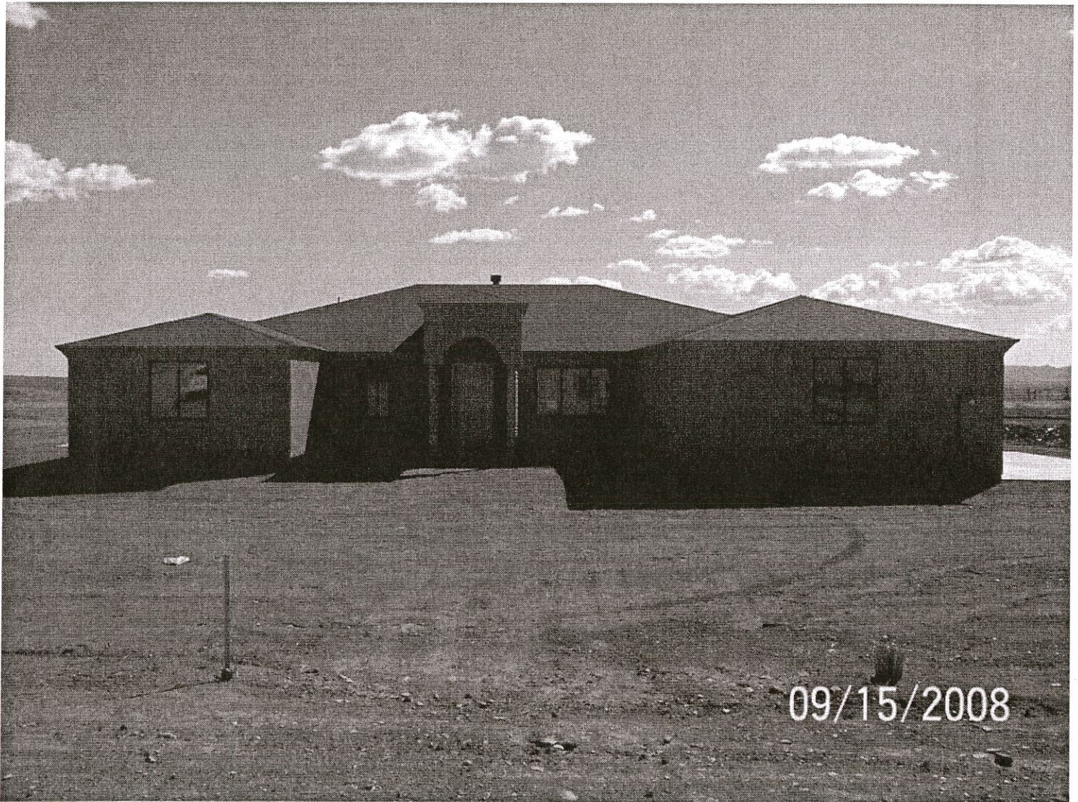
Description: North side of Home Looking South

If using the Elevation Certificate to obtain NFIP flood insurance, affix at least two building photographs below according to the instructions for Item A6. Identify all photographs with: date taken; "Front View" and "Rear View"; and, if required, "Right Side View" and "Left Side View." If submitting more photographs than will fit on this page, use the Continuation Page, following.