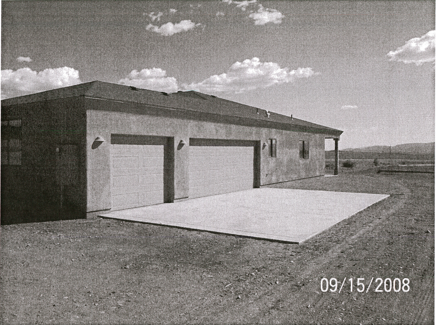
Description: West Side of Home Looking Southeast