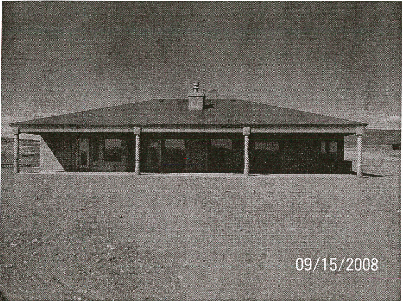
Description: South Side of Home Looking North

If submitting more photographs than will fit on the preceding page, affix the additional photographs below. Identify all photographs with: date taken; "Front View" and "Rear View"; and, if required, "Right Side View" and "Left Side View."