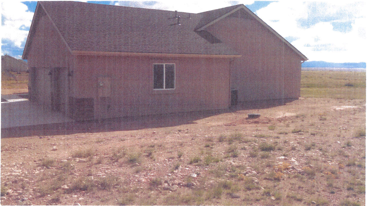
EAST & NORTH SIDES. C2E ON AC PAD. 1-26-15

If using the Elevation Certificate to obtain NFIP flood insurance, affix at least 2 building photographs below according to the instructions for Item A6. Identify all photographs with date taken; "Front View" and "Rear View"; and, if required, "Right Side View" and "Left Side View." When applicable, photographs must show the foundation with representative examples of the flood openings or vents, as indicated in Section A8. If submitting more photographs than will fit on this page, use the Continuation Page.