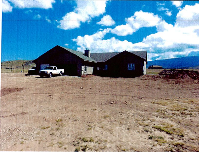
FRONT AND SOUTH SIDE HOUSE. LOOKING EAST FROM ROAD 9-20-2014

If using the Elevation Certificate to obtain NFIP flood insurance, affix at least 2 building photographs below according to the instructions for Item A6. Identify all photographs with date taken; "Front View" and "Rear View"; and, if required, "Right Side View" and "Left Side View." When applicable, photographs must show the foundation with representative examples of the flood openings or vents, as indicated in Section A8. If submitting more photographs than will fit on this page, use the Continuation Page.