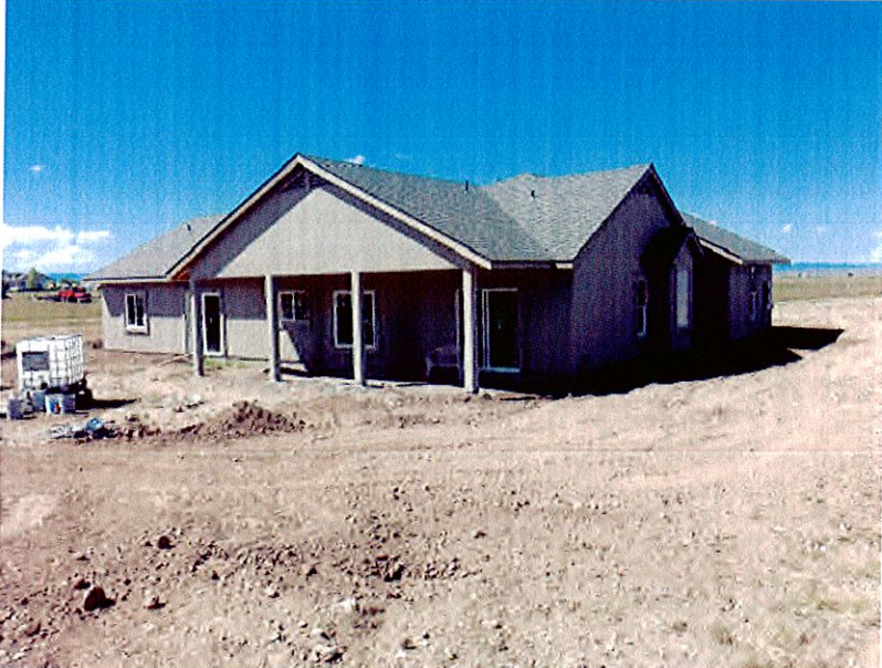
BACK AND NORTH SIDE HOUSE. LOOKING SOUTHWEST TOWARDS ROAD 9-20-2014